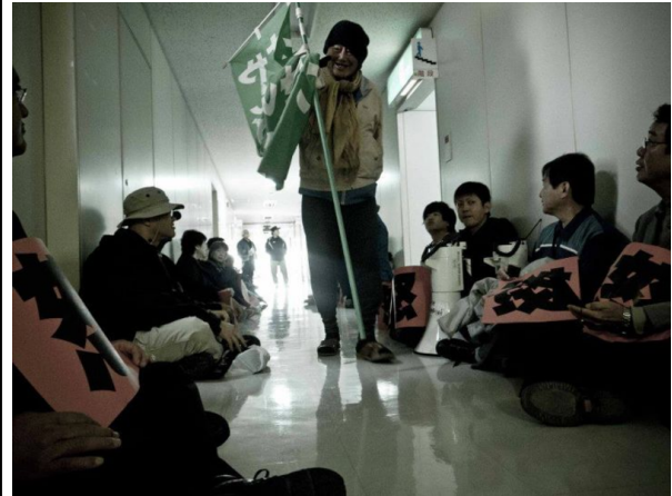
Protesters at Prefectural Office, Naha, 27 December 2011.

announced that ““We have had to give up on delivering [the document] directly to the prefectural office because of the blocking action, and so we have sent it by post.” The civic group, while recognizing that they had been able to block submission on that day, protested that “delivery by mail is trickery.”