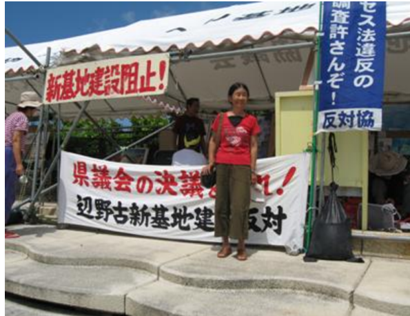
Author Urashima, Henoko, 2008.