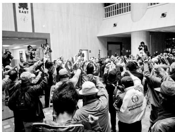
The Prefectural Office, 27 December 2011.

Whenever mail or parcel delivery vehicles appeared we asked them to stop at the entrance from the road so we could check the items they were carrying. Since each copy of the EIS was 7,000 pages and according to law there had to be 20 copies, and since deposit at a Post Office would mean the ODB losing control, and since the Okinawan people knew from previous experiences that the government was renowned for its outrageous lies, we were suspicious of the statement about “postal despatch.”