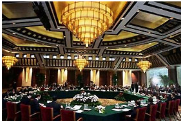
Diplomats attend the Six-Party Talks at the Diaoyutai Guest House in Beijing on September 19, 2005

The best, perhaps ultimately the only, prospect for moving forward on the diplomatic front lies with the Six-Party talks. The US proposal for Five-Party talks, in the absence of North Korea, can only result in further isolating of North Korea.