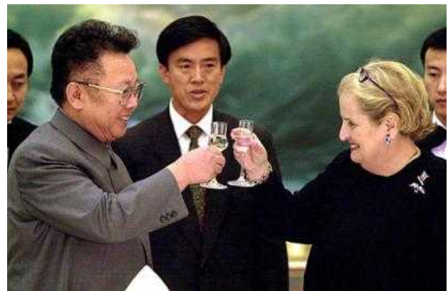
Secretary of State Madeleine Albright meets Kim Jong-il in Pyongyang

In 1994 the Clinton administration reached agreement with North Korea on a package that contained many of the elements of a solution of the second type. In exchange for freezing its nuclear weapons program, North Korea was promised light water reactors and heavy fuel to solve its energy problems. The implicit understanding, certainly on the part of North Korea, was that the agreement could pave the way for a Treaty ending the Korean War and establishing US-North Korean diplomatic relations. The failure of the Clinton administration to follow through on any of these promises led to the collapse of the deal, despite last-minute efforts to revive it in the final months of the Clinton administration.