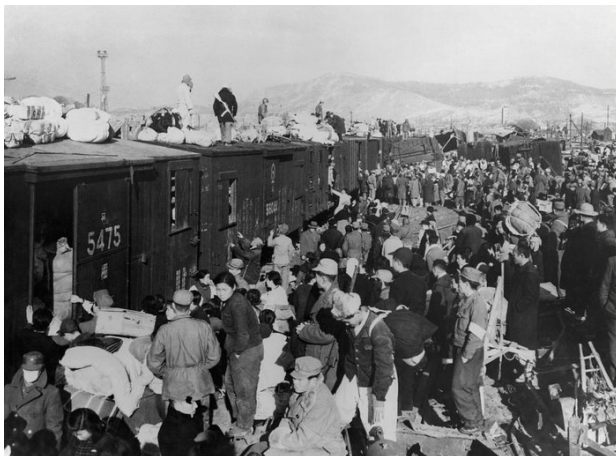
Refugees climbing on trains. Photographed: December 25, 1950

At the conclusion of the fighting, Korea lay in ruins. But the war never ended. It was stalemated in what was supposed to be a temporary armistice agreement. No peace treaty has ever been signed nor has normalization of relations been achieved between the principle antagonists, the Republic of Korea (South Korea) and the United States on one side, and the Democratic People's