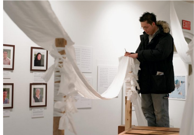
Exhibit visitor writes a message.