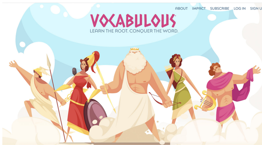
Figure 1. Screenshot of the Vocabulous homepage, www.vocabulous.co.uk .

subjects are offered, and decided to focus my efforts on the influence of Latin and Ancient Greek on English vocabulary. Vocabulary learning is a key issue in education: the Oxford Language Report stated that 43% of Year 7 students were arriving at secondary school with a poor vocabulary that limited their learning (Oxford University Press, 2018, p. 4). In addition, 92% of teachers surveyed by Oxford University Press believed that the COVID-19 pandemic and lockdowns have increased this problem (OUP, 2020). In my experience, too few students will try to work out the meaning of an unfamiliar word, and too many will simply give up if they've not met the word before. Vocabulous helps by giving students explicit training in exactly how they can deploy their knowledge of root patterns to work out the meaning of unfamiliar vocabulary, giving them skills which they can apply to complex words in any subject area.