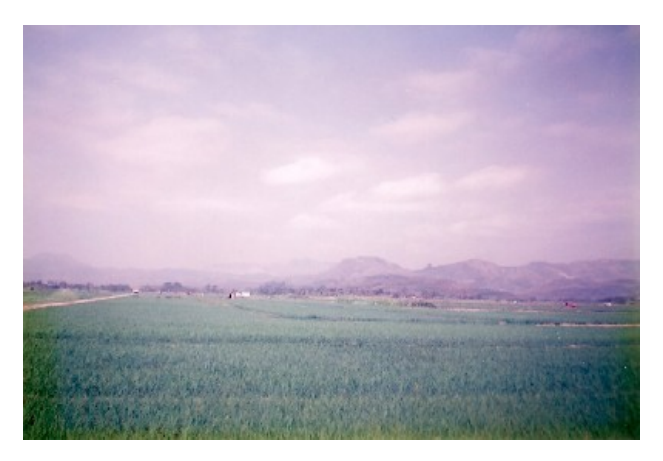
Rice fields in a Tai Lue village in Ganlanba (Meng Han), Sipsongpanna

The region has an ethnically diverse population of roughly one million. Over a third are Tai Lüe, another third are Han Chinese, and the last third are made up of a number of other ethnic minorities. These include the variously named Akha (in Chinese, "Aini" or "Hani"), Blang (in Chinese, "Bulang"), Karen (in Chinese, "Jinuo"), Wa, Yao, Hmong (in Chinese, "Miao"), Lahu, Khmu and others. Official counts of the number of ethnic groups in Sipsongpanna range from 13 to 16. The Tai are valley-dwellers who cultivate wet rice and practice Theravada Buddhism.