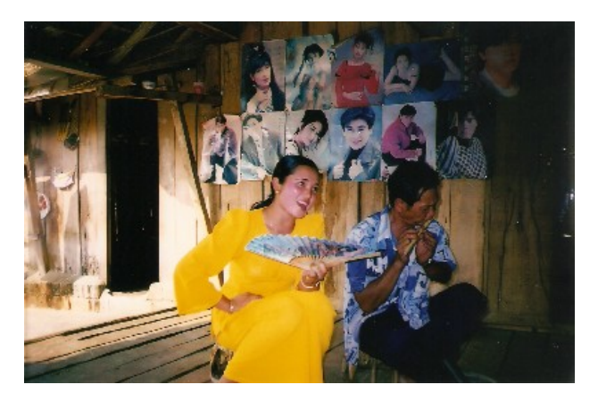
A young apprentice oral poet performs a poem, holding a

Many of the songs sung for tourists in Chinese ethnic theme parks are sung in Chinese. By any standard, it is a stretch of the imagination to call them folk songs. Tai folk songs are, of course, traditionally sung in the Tai language. In Sipsongpanna, as in much of mainland Southeast Asia, they are performed by highly trained professional oral poets in the form of duet/duels between men and women singers who may range in age from 30 to 80. The duets often become scathing put-downs and are highly bawdy. Some are also sacred, involving the citation of arcane texts and the narration of Buddhist epic legends (jataka tales) in literary language. Whether sacred or raucously profane, these folk songs are performed according to complex rhyme schemes that are recited against the rhythm of a free-reed instrument made of bamboo.