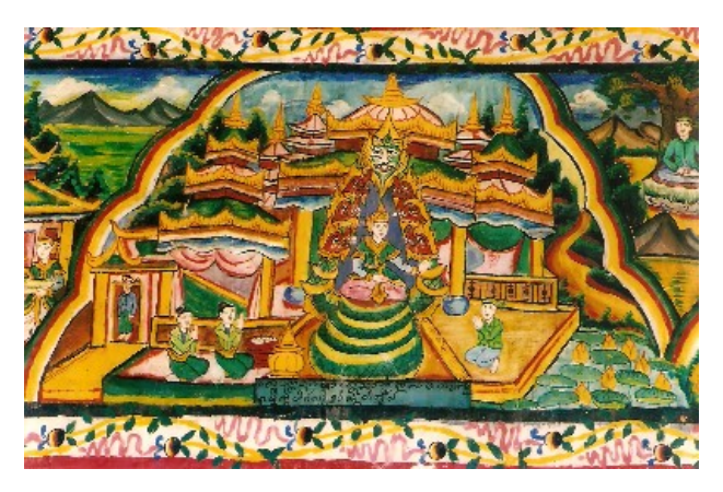
Panel of a narrative mural in a Buddhist temple near Meng Zhe, Sipsongpanna

In many villages where the crumbling state education system failed minority students, the temple was the only place to study. Some Tai Lüe parents preferred the temples to the public schools anyway, because in public schools their children were taught that the Hans were more advanced and minorities were backward. In the temples they heard about Buddhism and Tai Lüe history, learned to read the old Tai Lüe script, and teachers had the high status of holy men of learning.