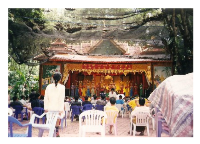
A government dance troupe performs the play "Zhao Sudun" for tourists in a Jinghong park.

As the simplifying project proceeded, other ballets and operas were edited. One, named after its hero, Prince Sudun ("Chao Sudun"), is based on an episode in one of Sipsongpanna's oral-narrative epic poems, "The Ten-Headed King." Some scholars believe the tale derives from the "Ramayana," an Indian epic. During the 1950s, the tale called "Prince Sudun" was cleansed of any religious or ritual meaning and rewritten as a socialist fable. An opera based on the fable was banned during the Cultural Revolution but now has been revived as a tourist show, performed daily for visitors at Jinghong's Chunhuan Park.