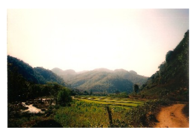
Fields and hills in western Sipsongpanna

An American researcher examines how the requirements of political assimilation have threatened the unique culture of China's Tai minority, and the Tai response.