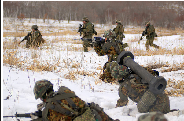
Marines training with GSDF soldiers at Yausubetsu, March 2008.

With the exception of the governor, the entire Okinawan leadership was now in the hands of anti-base forces, and even the Governor has faced tremendous pressure to reject the Henoko plan. Following the wave of optimism that accompanied the victory of the Democratic Party of Japan in the August 2009 elections on a specific pledge to move bases outside the prefecture, or outside of Japan, serious doubts have arisen about the base decision. In the face of intense US pressure, the DPJ is actively exploring alternative base sites including Henoko and other Okinawan islands as well as on mainland Japan and in Guam. Of course, even if the Hatoyama administration succeeds in honoring its election pledge to move Futenma out of the prefecture or out of Japan altogether, this would not be more than a slight dent in the US military presence in Japan: at present (March 2010) comprising 85 facilities covering 77,000 acres of land, and numbering 36,000 on-shore personnel and 11,000 personnel afloat. 12 Nor would this halt the increased integration of US and Japanese military forces, a process which is accelerating. The US military continues to conduct live-fire exercises in Yausubetsu. Indeed, the majority of SDF facilities are used jointly by the Japanese and US militaries on a daily basis, as are a number of civilian facilities such as ports and airports.