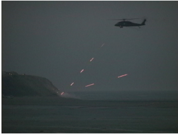
A helicopter gunship blasts an island off the coast of Maehyang-ri.

In the context of the Futenma base clash there are many lessons to be learned from the successful campaigns in Maehyang-ri to shut the firing range. Of course there are some important differences between Japan and South Korea, too. But we can summarize the keys to success as follows.