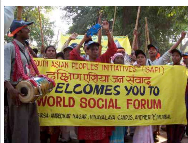
World Social Forum 2004

The International Network for the Abolition of Foreign Military Bases (INAFMB) took off at the World Social Forum held in Mumbai in January 2004 and was launched officially as a result of its first international conference in Quito and Manta, Ecuador, in March 2007. I attended the Mumbai meeting as the representative of HAALA. It was an unforgettable experience. To have 130,000 people gathering from across the globe under the slogan 'Another world is possible' in a meeting of such diversity and vibrancy was enough to really make one believe it could happen. In particular, the demonstrations by members of India's so-called 'untouchables' caste left a particularly strong impression. Their cries of 'If another world is possible then it must include us' brought it home that only by raising one's voice is there any hope to change things.