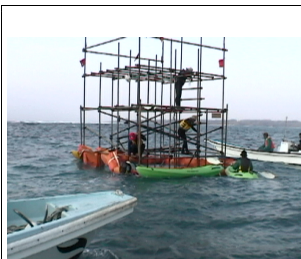
Protestors try to prevent survey work on the proposed Henoko offshore runways site.

month (October 2005) for a two-runway base in Henoko along the coast of Camp Schwab in Oura Bay. The deep water in Oura Bay means nuclear aircraft carriers would be able to visit. All these plans have been made in the face of stiff local opposition and would destroy a pristine marine habitat supporting among other species rare blue coral reefs and the internationally protected dugong. 4 Just before the Democratic Party of Japan defeated the Liberal Democratic Party in the 30 August 2009 general election, the outgoing and deeply unpopular Aso administration signed the so-called Guam Treaty, which the US interprets as binding the Hatoyama to an agreement to build the Henoko base. 5