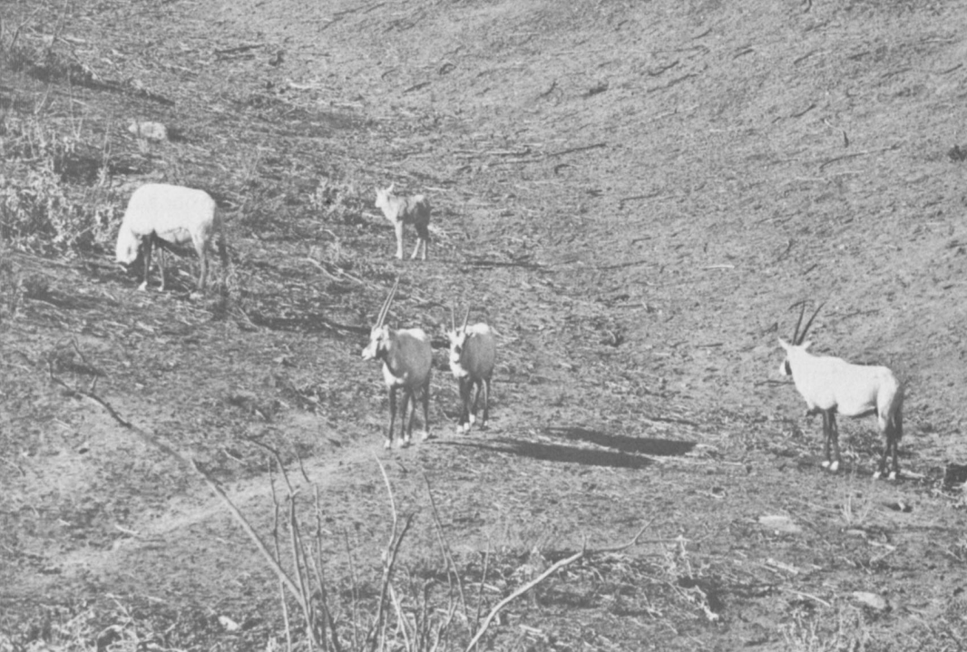
A GROUP at San Diego Zoo, part of the World Herd

grazing caused by the arrival of large herds of goats and camels with herdsmen probably forced the oryx to retreat into less favourable pastures. Thesiger and Stewart assume that oryx stayed in the sands in winter when rain had induced fresh plant growth, and also that summer heat and lack of shade forced them out of the dunes into the cooler open gravel plains where trees and shrubs gave some shade. However, these conclusions have to be considered with care, as they are not based on their own or other scientists' observations, but on information from travellers and tribesmen. A report that oryx in the wild dig shallow depressions with their hooves in soft ground under trees and shrubs for resting has been confirmed in captivity.