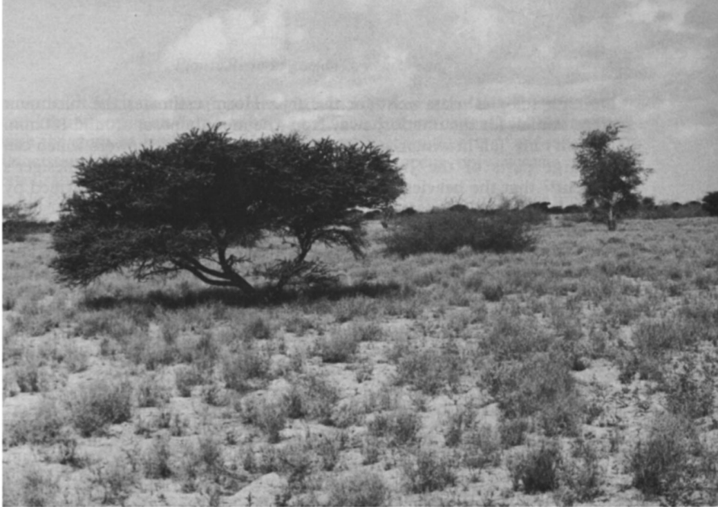
Above: Wadi Yalooni with Acacia tortilis, A. ehrenbergiana and Prosopis ceneroria Below: Dry gravel plains of the Jiddatal Harasis with pans and drainage lines covered by vegetation