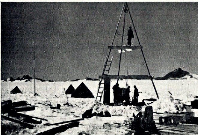
Fig. 1 (top left). Rotary pioneer drill rig and tripod erected at 3640 ft. (1110 m.) on upper Taku Glacier 1950