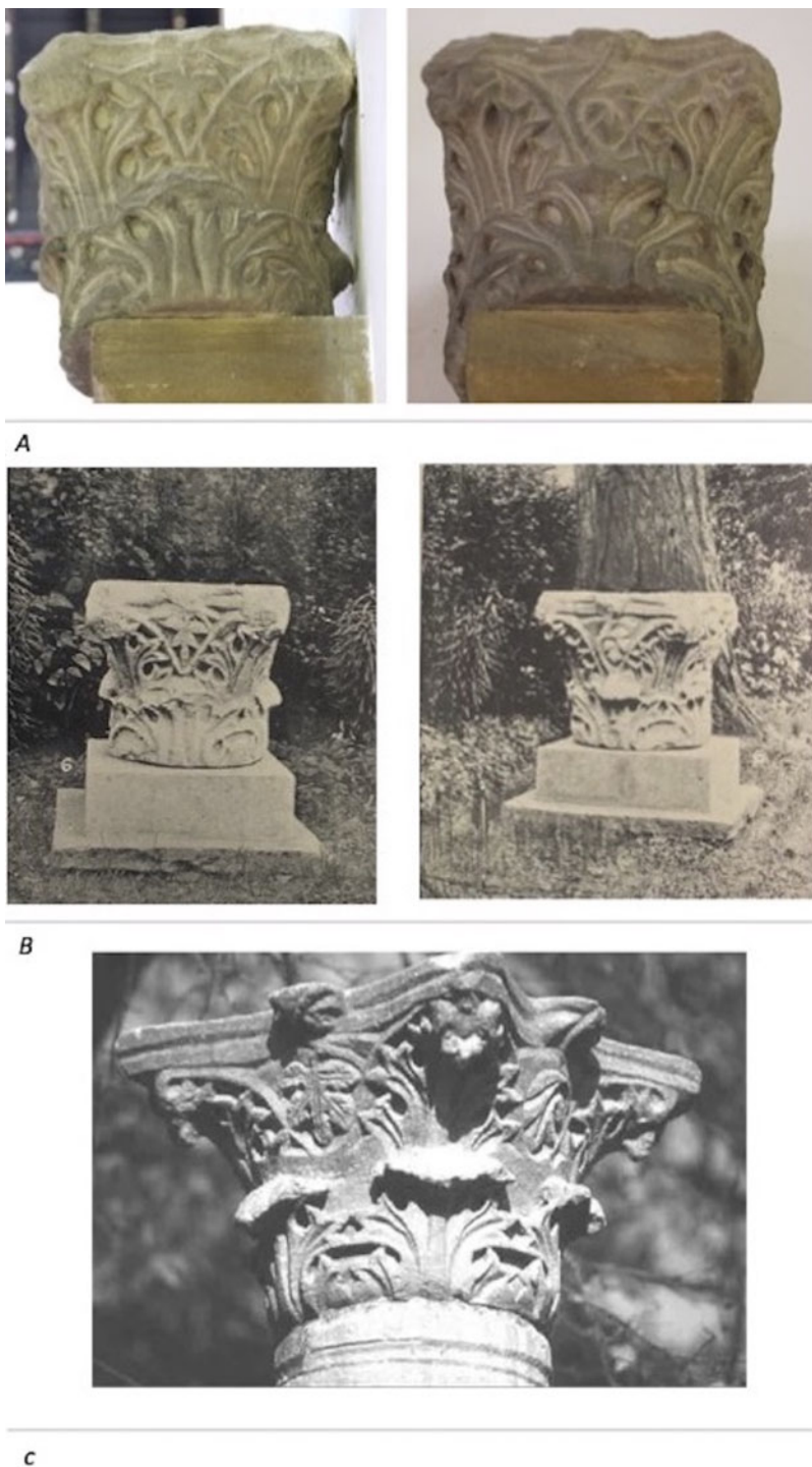
Fig 3. Lyre Capital from the Blachernai area and comparisons. A) Lyre Capital, Blachernai area, Constantinople, 5th-6th c., Lower Kingswood (Surrey), Church of the Holy Wisdom of God; B) Lyre Capital from the Blachernai area as it appears in Freshfield's Memorandum (1903); C) Lyre capital, 5th-6th c., Ayasofya courtyard (after Guiglia, Barsanti, Paribeni 2008).