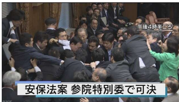
Protest against National Security Law, 15 September 2015