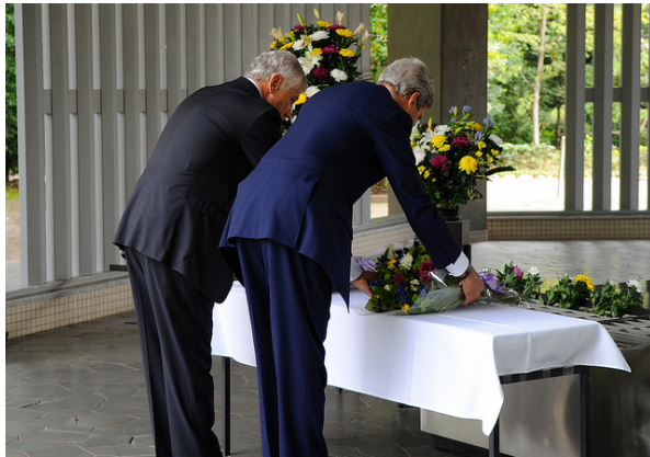
John Kerry and Chuck Hagel at the Chidorigafuchi National Cemetery, 3 October 2013

advancing economic development and guaranteeing mutual security. This is clearly a China containment policy. It is virtually impossible to build friendly relations with China on that foundation.