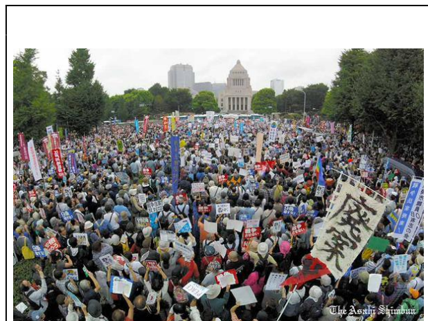
Protest against National Security Law, 30 August 2015

This added momentum to the keen sense of crisis already motivating the public to action, the perception that the security legislation would change Japan into a country that would fight wars. This alarmed young people. In addition to the issue of unconstitutionality, the issue of peace—and whether there would be a military draft—loomed large in their eyes.