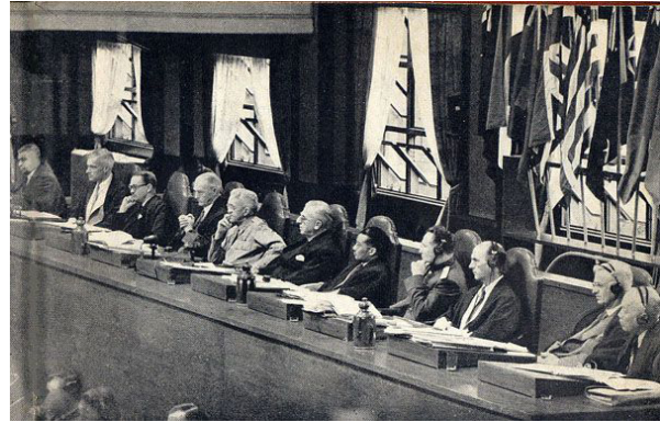
International Military Tribunal for the Far East, 1946

MacArthur made strenuous efforts to ensure that the emperor, far from being prosecuted or even forced to testify in the Tokyo war crimes trial, retained the throne. He promoted a constitution that removed the governing authority of the emperor, while preserving his status (in Article 1) as “the symbol of the state and of the unity of the people.” This was done rapidly so the draft would be ready before the Far Eastern Commission (which would have the authority to decide policies for the occupation of Japan) could be set up and issue a directive to prosecute the emperor. The draft constitution was comparatively democratic, with content that would not raise objections among the public in either the Soviet Union or the US. That constitution was adopted, so the postwar emperor system is often referred to as an American-made system.