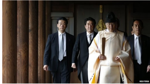
Abe visiting Yasukuni Shrine, 26 December 2013

When it comes to relations with the US, there's no way the US will accept the stance that the Great East Asia War was legitimate. As a result, US-Japan relations were very tense for a while. In October 2013, when Secretary of State John Kerry and Secretary of Defense Chuck Hagel arrived in Japan for negotiations on the US-Japan defense guidelines, their first stop was to make an offering at the Chidorigafuchi National Cemetery, (which houses a memorial to unidentified war dead and is considered a neutral war memorial compared to the politicized Yasukuni Shrine). It was a forceful expression of displeasure. Shortly afterward, PM Abe made a visit to Yasukuni. The US embassy issued a statement of "disappointment" over his decision to do so. Abe's stance creates cracks in the Japan-US relationship.