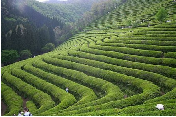
Green tea field, Korea

As a third and final example of diffusion, one that happened in totally unexpected ways, I refer to the spread of the soybean and its byproducts. Soybeans, as I noted, were known in the West at an early time. But not until World War I did that interest become commercially relevant, as wartime demand for oil, particularly for industrial uses, shot up. In the U.S., soybean production rose, but principally for its oil, while the plants were ploughed under to enrich the soil. Between world wars, American soybean production remained minor. But with World War II, soybeans became economically important once more. Once again, though, soybeans were not important as a primary food. This is the most dramatic aspect of the diffusion of soybean cultivation and use to the West: a transformation of the uses to which soybeans were put. The stress upon exportation, the manufacture of cooking oil, and the provision of animal feed became the fate of what had been Asia's greatest contribution to global vegetable protein consumption. When we note that the annual soybean crop in the U.S., the world's leading producer of soybeans, provides enough protein for the needs of the U.S. population for three years, it is startling to realize that hardly any humans get direct benefit of that protein. In the U.S., much of the protein is fed in meal to chickens, which are then fried in soybean oil in fast-food restaurants. It is the birds – or pigs,