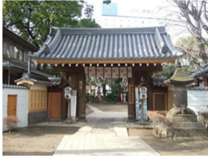
The Honsenji temple in Shinagawa