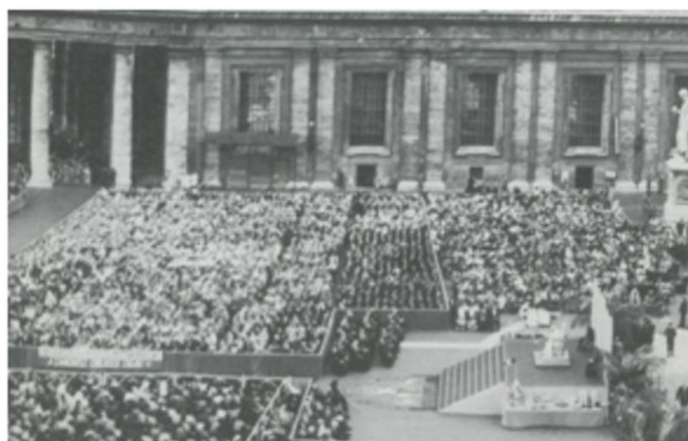
The papal Mass in St. Peter's, 22.5.80