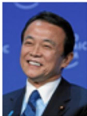
Asō Tarō, Japan’s Catholic prime minister (2008-9)

course, on state patronage of the shrine, which is contentious on at least two counts: it is a ‘legal’ problem since the Constitution provides for the separation of religion and state; and a ‘symbolic’ one since Yasukuni enshrines Japan’s A-class war criminals. Against this institutional position, I set the views of some prominent Catholic intellectuals. What is striking is that, on the whole, these Catholics distance themselves from the critical stance of the Japanese bishops, and share with the Vatican, and indeed with former PM Asō, a broadly positive ‘take’ on Yasukuni. My method here is to introduce faithfully a selection of their views, and let the reader judge their merits. In the final section, the present author, who is also a Catholic, offers his own argument on Yasukuni and the challenges it poses in the 21st century.