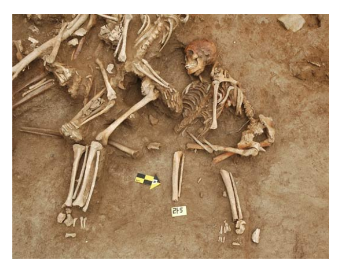
Photograph of remains of some of 110 victims executed by ROK forces at Cheongwon.

The TRC was established by the government of South Korea in 2005 and will issue its final report in 2010. It has received 10,907 petitions from individuals and organizations to investigate the history of the anti-Japanese movement during the colonial period and the Korean diaspora; the massacre of civilians after 1945; human rights abuses by the state; incidents of dubious conviction and suspicious death, including 1,200 incidents of mass civilian sacrifice committed by ROK forces and US forces (215 cases). In 2007 the TRC has excavated 4 among the 160 suspected mass graves. Then President Roo Moo-hyun has apologized to the citizens for the 870 victims confirmed at Ulsan. South Korea now has a new government and the TRC is currently fighting budget cuts and restrictions in order to complete its daunting and painful task.