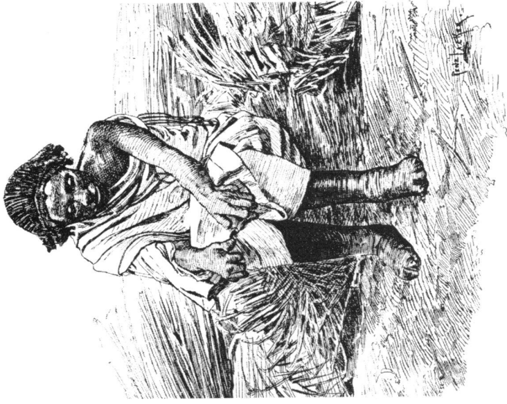
Figure 3. An Ethiopian leper.