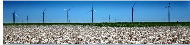
Roscoe wind farm, Texas

strong foundation for federalizing America's localized green revolution. Keep in mind that Texas has become a world leader in wind power thanks to a Renewables Portfolio Standard that Bush signed in 1999, when he was Governor. [link]