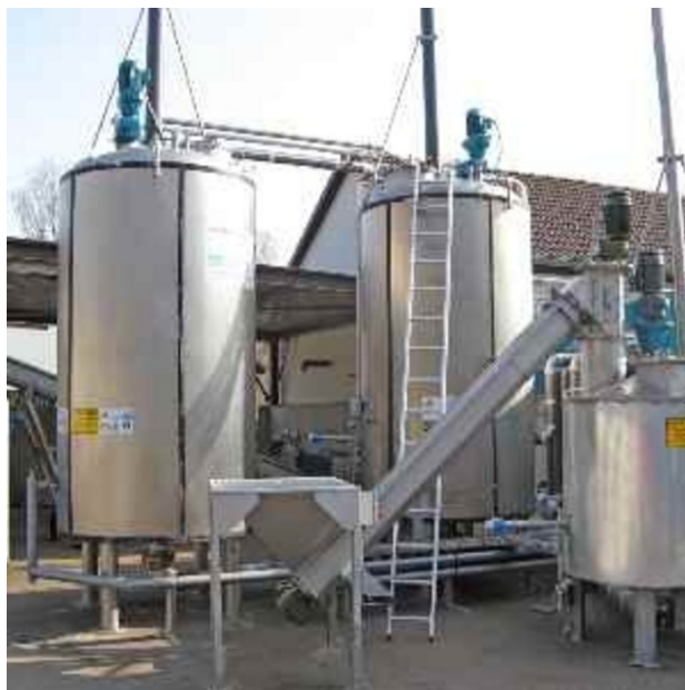
German solar technology

In spite of this multifaceted crisis and its implications for economic policymaking, the Japanese elite continue to hamstring the country in the midst of an incipient green industrial revolution. It takes a Bush-league scale of incompetence to toss away a lead in solar technology, as Japan has done. Japan axed its solar subsidy in 2005, and saw its market share slide. Meanwhile, the Germans in particular were making green technology the core of their domestic energy supply and world-beating export machine. Germany is now “accelerating its efforts to become the world’s first industrial power to use 100 percent renewable energy – and given current momentum, it could reach that goal by 2050.” [link]