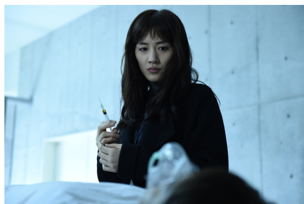
Ayase Haruka as Kyōko in Watashi o hanasanaide , about to euthanize a fellow