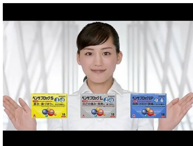
Ayase Haruka offering solutions for your cold. © Benza Block.

Ayase features in five different commercials during the pilot episode, with one ad repeated. This is Pantene 'Virgin Hair Showdown', in which the actor squares off against a schoolgirl in a battle for the shiniest hair. Positioned over an image of their juxtaposed lustrous locks, the final title card reads "Is their hair equally as shiny?" Is this a straightforward appeal to youthfulness, or virgin-birth clones in the making?