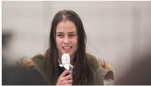
Manami gives a speech about clones' rights before committing suicide.

The first problem with this character is that it goes against Ishiguro's stated objective for his novel, namely to challenge his readers by frustrating them with a narrative method that could be termed 'asymptotic':