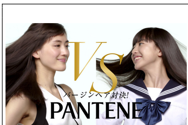
Ayase Haruka versus schoolgirl in a commercial for Pantene shampoo.

It is a telling irony for this drama that the Japanese word teikyō (提供) can mean both 'sponsorship' and 'donation'. In Ishiguro's vague SF world, human clones donate their organs to sick humans, having somehow revolutionized medicine. But throughout the commercial broadcast hour of the Japanese drama, lead actor Ayase appears not just as a character in a drama, but as various versions of her 'real' self in numerous advertisements for shampoo, medicine and cosmetics, a broaching of the fourth wall that remains unthinkable in the West. (Many viewers not watching at the time of broadcast will of course skip through the ads, but will still catch a glimpse of Ayase the commercial spokesperson or 'image character' at show/ad boundaries.)