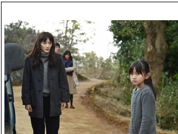
Kyōko meets a child-clone version of herself.

Never Let Me Go as his most ‘Japanese’ novel, thereby virtually giving the producers licence to mine his original work and use the Japanese setting to bring out latent elements. So what thematic deep-diving can be observed in the finished product? First of all, the central figures’ childhood is indeed fleshed out. We get a real sense of the scorn with which society views the clones in subtle touches such as the cast-off, thread-bare clothes the children wear. Far more sensationally, rumours are promulgated, as a form of social control, that the surrounding forest is home to a child killer; when two boys climb over the wall, they never return, having become forcible child donors for the sin of challenging authority. But one of their blood-dripping shoes appears on the iron gate of the school as a warning to the others.