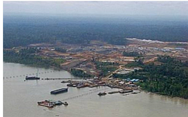
Tangguh LNG facility under construction

become politicised. Whilst the PDI-P has stressed that both President Yudhoyono (SBY) and Kalla were also serving in the Megawati government at that time, the Tangguh issue could easily end up as ammunition for SBY and Kalla to attack Megawati during the presidential race of 2009. Such a scenario could complicate relations with China.