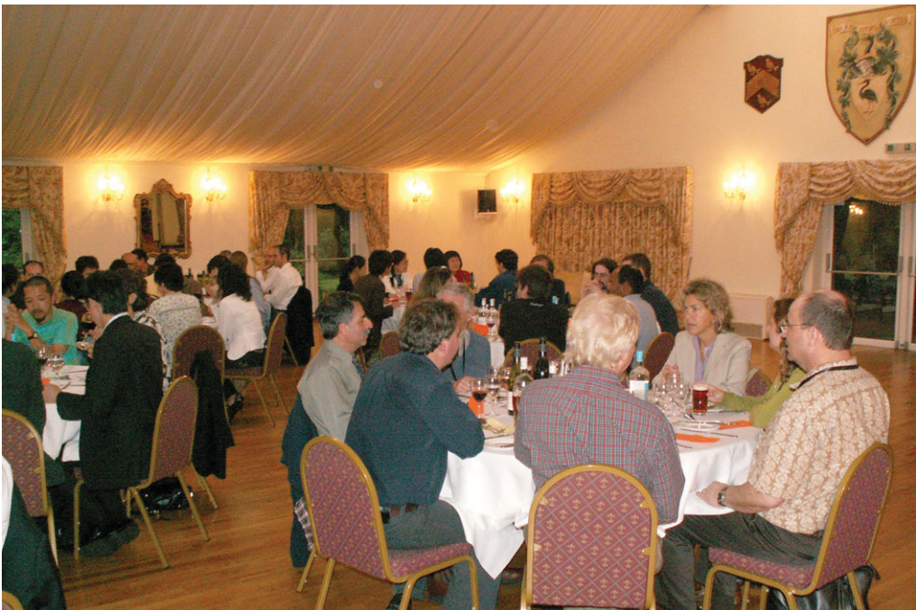
At the conference dinner inside Wrenbury Hall.