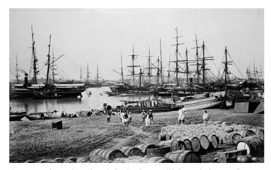
Figure 1.1 Landing goods in Calcutta (Kolkata), India, 1860s.

in India, told a Royal Commission in 1887 that as a result of the telegram there were very few 'Manchester' (cotton) goods shipped to India for sale on consignment. He explained: