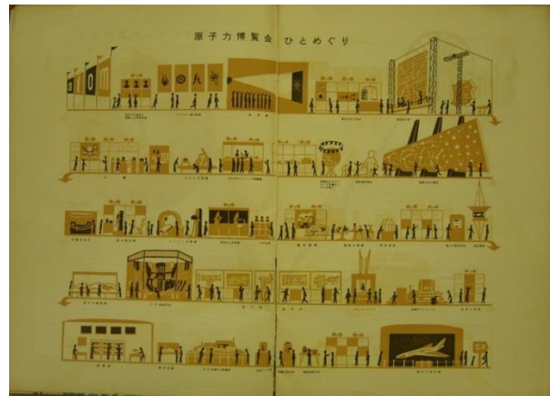
The layout of the exhibit as depicted in exhibit official brochure. Visitors walked through the futuristic exhibit examining the application of the atom in agriculture, medicine, space travel and other fields.

The local media praised the exhibit on its opening day, speaking of "a new human civilization," and, echoing the Yomiuri , on man gaining control over "a second sun." 54 Local dignitaries interviewed after a VIP preview of the Atoms for Peace exhibit were equally ecstatic. The head of the prefectural chamber of commerce told the papers, "we are entering a splendid era ( subarashii jidai )... it is good that I achieved old age [to see it]. [This era] is full of wonder and [we are laying] the infrastructure to make it happen." 55 Others, especially scientists, again stressed the importance of understanding the atom. Nakaizumi Masanori, from the ABCC, commented, "the region of Hiroshima has an inseparable relationship with nuclear power and thus should have a correct understanding [of it]." Former (and future) Mayor Hamai took a similar approach. "I heard much about this. It is good to see it firsthand... it is the first step that people should talk of deepening our understanding of nuclear power." 56 The equation of American science and ideas of progress with neutral or positive values was, of course, a peculiar