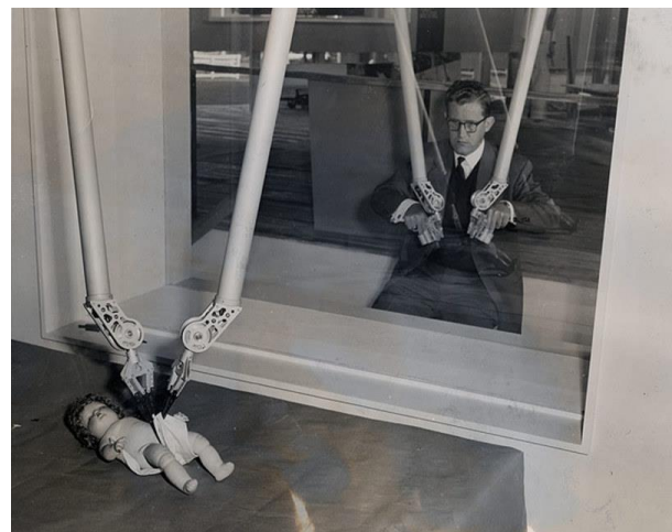
"Magic Hands" Demonstration in Berlin. September 26 1954.