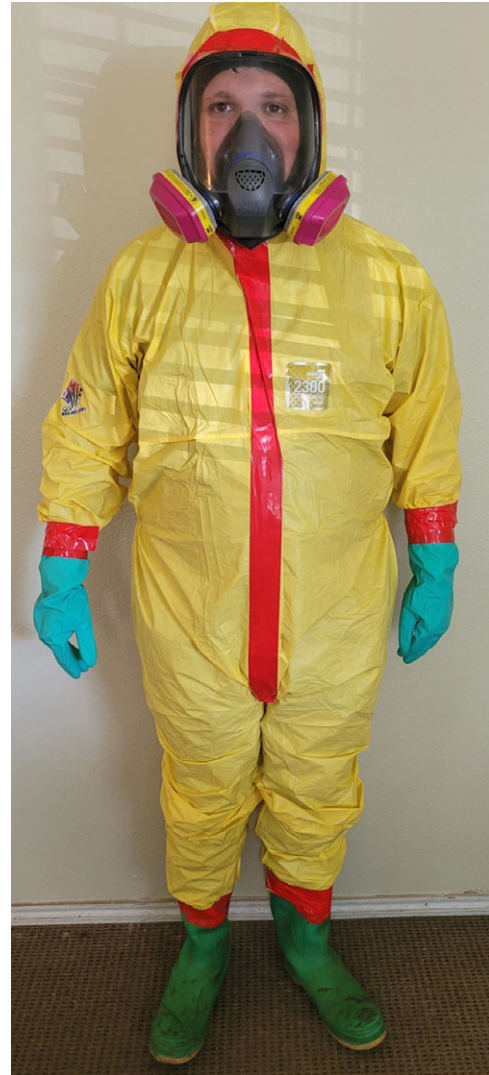
Figure 1. Full decontamination PPE.

A conservative multistage approach was utilized in the decontamination process to avoid excessive damage to apartment materials, electronics, and personal items of the individual. Cleaning solutions were chosen for their effectiveness against pox viruses and limited corrosive qualities and included a germicidal quaternary ammonia agent (Mediclean [EPA 70385-6]) and hypochlorite solution (bleach). 7,18 Nonchemical methods (ultraviolet [UV] light wands) were also used to assist decontamination of items that could not have liquids or sprays applied (paper products). Hydrogen peroxide solution was considered but rejected due to its corrosive, oxidizing nature.