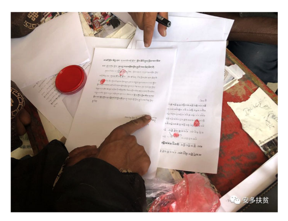
Figure 2: A Household Agreement Accepting Voluntary Resettlement

voluntary, these officials conduct a survey to determine households' willingness to participate. This is followed by a series of whole-village meetings and, if possible, a visit to the resettlement site. As a process of group thought work, the meetings both encourage villagers to sign agreements and warn of consequences for not doing so, including more severe thought-work sessions, less favourable future resettlement packages and ineligibility for future development projects. In addition, villagers are threatened with administrative punishment for "spreading rumours" or refusing to participate in thought work. Finally, holdouts are intensively targeted on an individual household basis for further thought work until they sign statements which assert that they have given their voluntary assent. Although our research was focused on pastoralists in Nagchu, similar processes have also been described in government reports for Shigatse, Ngari and Lhokha, where the policy is also being implemented.<sup>93</sup>