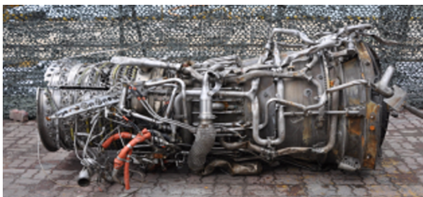
Figure 3. The Diesel Engine Room and Gas Turbine

Second, even if the JIG succeeded in demonstrating that an outside explosion occurred – and it did not – it still needs to show that the explosion was that of the torpedo recovered by the JIG. But its claim that the