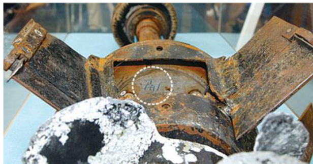
Figure 5. The Torpedo with Korean marking

estimates suggest that the torpedo would have been subjected to heat of at least 350 degrees Celsius and quite likely over 1000 degrees, high enough to burn the paint and thus the ink as well. This inconsistency – the high heat tolerant paint was burnt but the low heat tolerant ink was not – cannot be explained and casts serious doubt on the integrity of the torpedo as “critical evidence.” 18 Furthermore, both North and South Koreans can write the Korean letter “1bŏn”, and thus we doubt that a regular court of law would consider the mark evidence of exclusive North Korean writing. 19