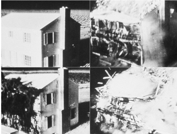
Figure 2. Damage done by 5 psi on a house