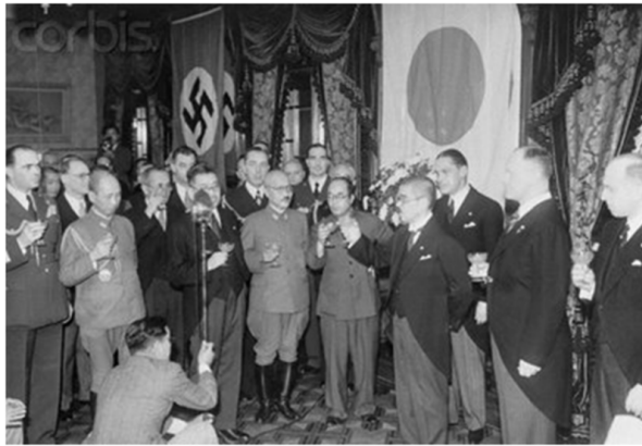
Celebrating the tripartite pact in Tokyo

The question of why resource-poor Japan would take on the world's superpower and its allies continues to baffle analysts of the wartime period. Between 1937 and 1945, the Japanese state squeezed the economy through strict rationing in the civilian sector and control of management and labor in order to channel a dwindling supply of precious resources to the military's ambitious production expansion and material mobilization plans. 2 The drain on resources from the protracted war in China, food and energy shortages, higher import costs as a result of the European war, and rapidly deteriorating trade relations suggested that Japan had little chance of victory in a war against the United States.