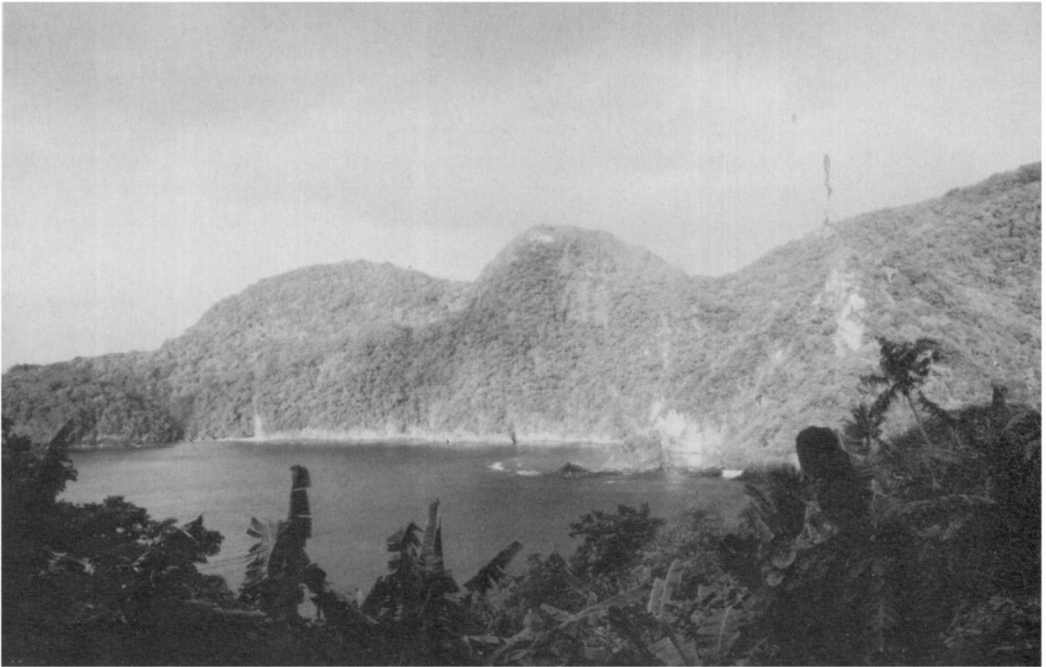
View of Tutuila, American Samoa.

Palau are currently the major exporters to Guam.