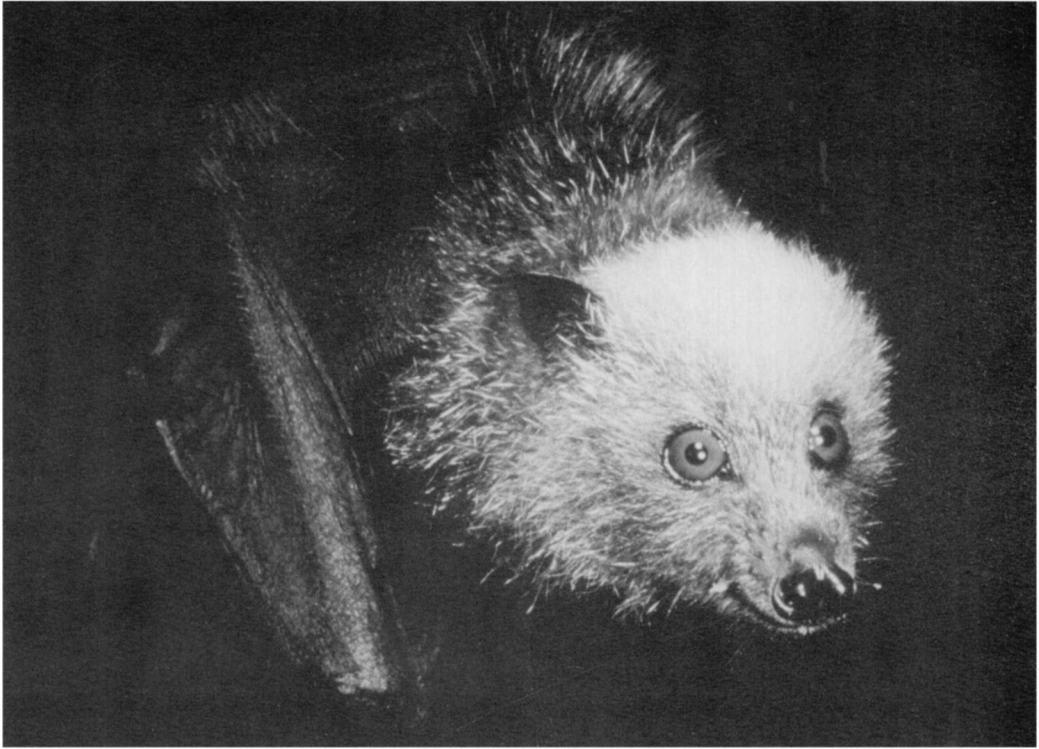
Samoan flying fox Pteropus samoensis.

primary distribution is in the Pacific region: as many as 47 of the 57 species in the genus are found east of the Indian Ocean. In addition, Pteropus is primarily an island taxon, with 55 species (96.5 per cent) distributed entirely or at least partially on islands (Pierson and Rainey, in litt. ). The geographic ranges of most species are extremely small: 35 species (61.4 per cent) are restricted to single islands or small island groups. Only seven species are found on continental land masses. The genus Acerodon is more limited in its distribution, being confined to the Philippines and central Indonesia (Musser et al. , 1982); none of the six species occurs on continental land masses.