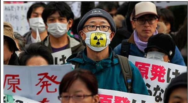
Protestors demonstrated against nuclear power in Tokyo on Sunday, as officials admitted the crisis at the Fukushima Daiichi nuclear plant could take 'months or years' to be resolved.