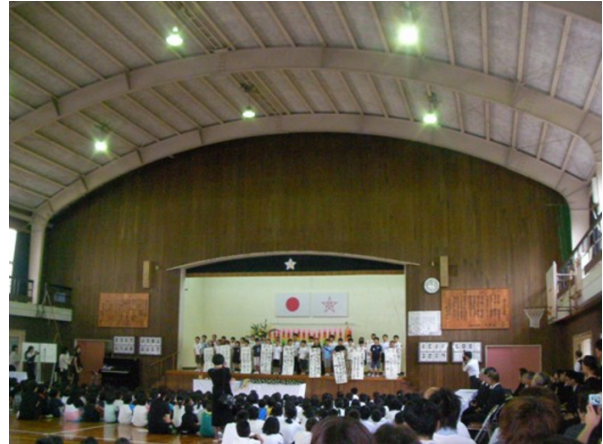
Shiroyama Elementary School Peace Ceremony, Nagasaki, August 9

Novelist and Nobel laureate Oe Kenzaburo, in his column for the New York Times for the Hiroshima Day 2010, wrote of the Hiroshima ceremony as follows: “Of all the official events that have been created during the past 200 years of modernization, the peace ceremony has the greatest degree of moral seriousness.” 61 There are doubtless other peace ceremonies throughout the world that carry equal “moral seriousness,” but those in Hiroshima and Nagasaki, which I have attended for the last five years, have embraced me and my whole being in ways unlike any others. I appreciate children’s participation particularly. For me, the climax of the annual study tour is always attending the memorial ceremony at Shiroyama Elementary School in Nagasaki. Over 1,400 of the students and 31 teachers of this school, which is located 500 meters from the hypocentre, died in the atomic bombing. The school has its own peace ceremony and all students attend, though August 9 falls in the summer holiday. Peace meetings are in fact held at Shiroyama Elementary, not just in August; but on the 9th day of every month, and they have been conducted for almost 60 years since 1951.