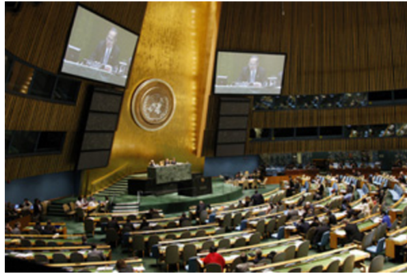
NPT Review Conference in the General Assembly Hall

There was general dissatisfaction among non-nuclear states that, during the course of the negotiation, nuclear states refused to set a clear timetable for total elimination of nuclear weapons or to hold a conference for disarmament in 2014 to set a schedule for abolition. The idea of convening an international conference to formulate a roadmap for nuclear abolition, which was in the earlier draft, was eventually removed. 25 Nor was the deadline of 2025 sought by 118 nations of NAM (Nonaligned Movement states) for complete nuclear disarmament included in the final document. The plan for a 2012 Middle East nuclear free-zone conference appeared to be the most concrete agreement in the final document, but the US and Israel dissented immediately. Barack Obama “strongly opposed” Israel, the only nuclear power in the Middle East, being singled out. 26 (For a summary of media reports and assessments of NPT 2010, see Link .)