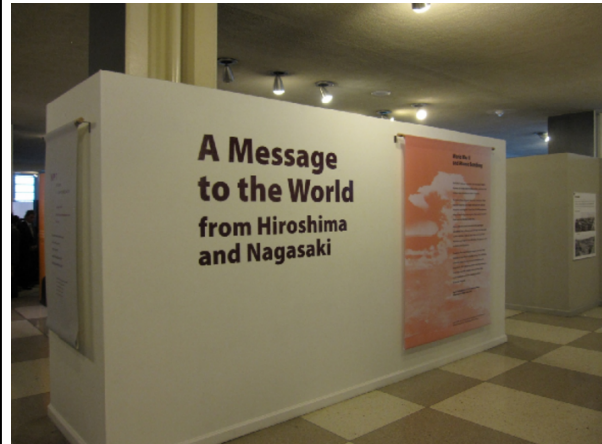
A-bomb Exhibit at UN Visitor Centre

This May, the hundred hibakusha were active in New York. For the first time, Hidankyo hosted a large A-bomb panel exhibit in the U.N. Headquarters' Visitor Centre's lobby, which ran from May 3 to the end of June. Hibakusha took turns attending the exhibit, answering questions and telling their stories to visitors. Hidankyo representatives met with Secretary General Ban Ki-moon, and wrote to all 192 member states of the U.N. requesting to visit their U.N. mission's offices. They were able to visit seven of them - Brazil, Malaysia, Japan, New Zealand, Sweden, and surprisingly, two nuclear weapon states, Russia and France. In fact, France did not respond, but French anti-nuclear activists who were in town for the conference brought Hidankyo delegates to their representative's office, and a meeting took place.