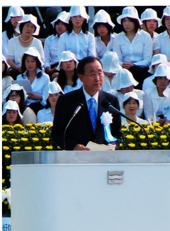
UN Secretary General Ban Ki-moon at Hiroshima Memorial, August 6, 2010

There was something, however, that I was expecting to hear in Ban's speech and did not—the idea of a Nuclear Weapons Convention (Convention on the Prohibition of the Development, Testing, Production, Stockpiling, Transfer, Use and Threat of Use of Nuclear Weapons and on their Elimination). Such a goal is supported by Ban, as well as by atomic-bomb survivors' organizations like Nihon Hidankyo , Mayors for Peace, and many other NGOs around the world. It was also mentioned, if rather subtly, in his "five-point plan to rid the world of nuclear weapons." 28 Ban said, "I especially welcome your support for the idea of concluding a Nuclear Weapons Convention," at the NGO Conference at Riverside Church, on May 1. 29 The idea of such a convention was included in the final document of the 2010 NPT Review Conference because of Ban's strong