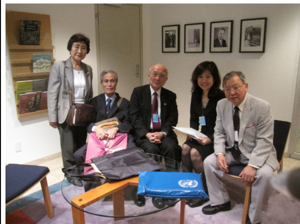
Hidankyo Executives at UN Swedish Mission 12

The hibakusha visited forty schools, telling their stories to local students. Another group of over one hundred people served as local volunteers, most of them bilingual Japanese-Americans, who contributed as translators and helpers for hibakusha during school visits, demonstrations, and conferences. The hibakusha, local volunteers, and international activists shared a real sense of camaraderie. The highlight of hibakusha activism in New York was the rally and demonstration held at Times Square on May 2 by volunteers and sponsors of peace and anti-nuclear