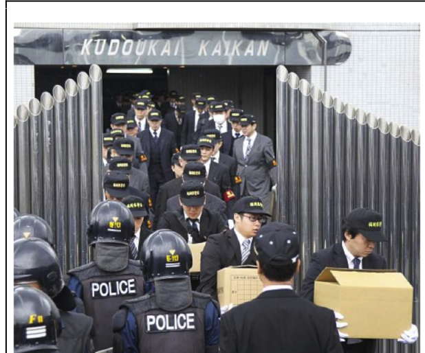
January 2012: Police raid a yakuza gang headquarter

As Peter Hill says, 'The police and the yakuza are ultimately rivals in the market for protection' (Hill 2006:258). The yakuza themselves are alert to this phenomenon. A Tokyo gangster says, 'Ever since the cops started getting tough, the gangs have lost a lot of their power to take kickbacks and collect debts. And what happens to that power vacuum? Out goes the yakuza gang and in comes the Sakuradamon gang [i.e. the Metropolitan Police Department, headquartered in Sakuradamon]'. 4