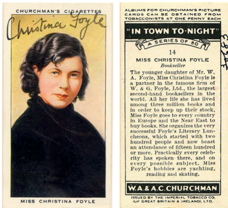
Figure 2 A cigarette card showing Christina Foyle

a celebrity – so much so that she was chosen to appear on a set of cigarette cards (see Figure 2).