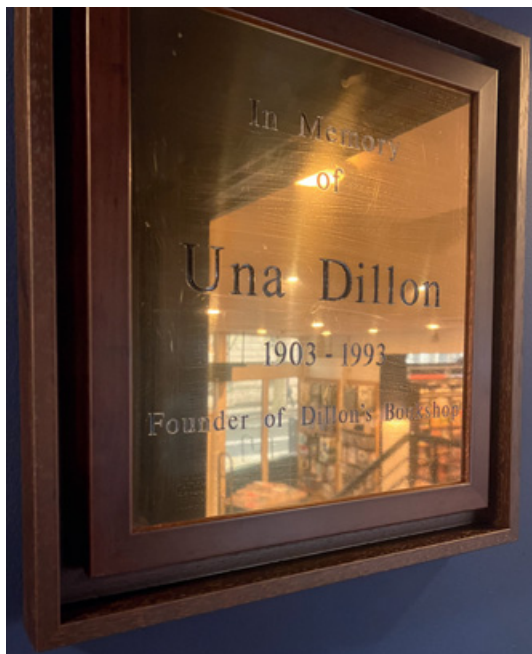
Figure 8 Picture of the reinstated Dillon plaque, taken on 1 May 2024

Booksellers of the past contributed significantly to the cultural and intellectual lives of the people they served: they should not be hidden in the bookshelves of history. They are often, as this Element has hopefully shown, dynamic agents within the communications circuit. The women booksellers, moreover, as this Element proves, should more correctly be known as formidable , using the French term and meaning, rather than formidable in the English sense. True, they did use clothing and accessories to create and support their business personas – but there is not a ravelled cardigan in sight, in any description of the women here. Rather the evidence shows women who were successful at building up their own businesses, and running them during exceptional times. They worked at local, national, and