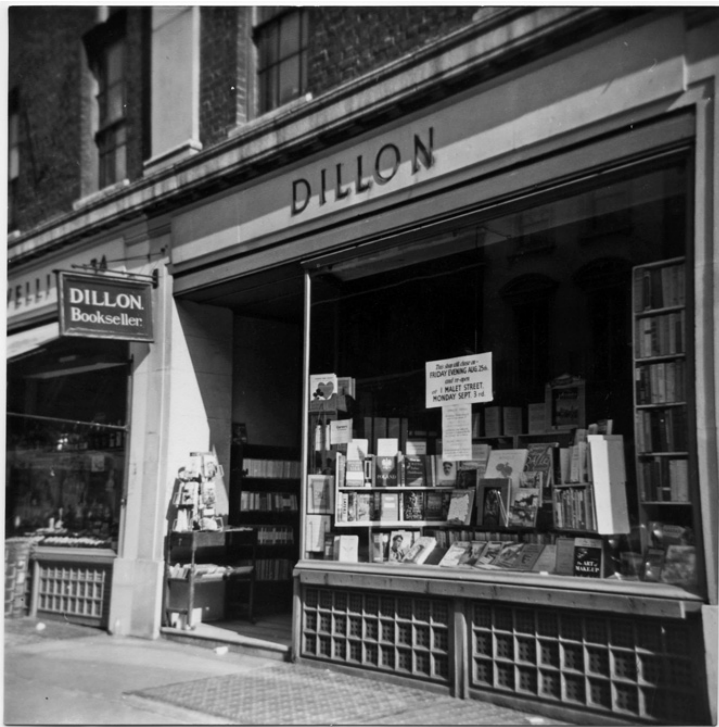
Figure 3 Image of Dillon Bookshop 33 Store Street

support which the shop, and its owner had, and the determination and courage it must have taken to have kept going. Today that space is still a bookshop, Treadwells, an esoteric specialist selling old and new books. 271