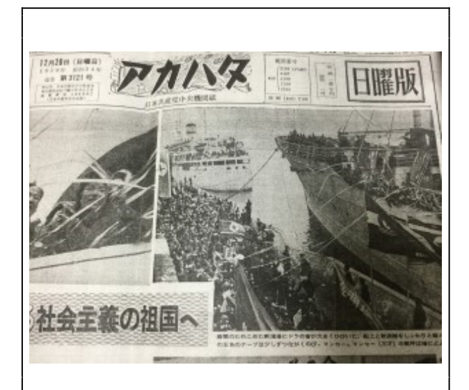
"With Throbbing Hearts, to the Socialist Motherland" Akahata headline, December 20, 1959. On the photos: the first ship leaving Japan on December 14, 1959, with zainichi Koreans being transported to North Korea on board

ours and I understand Okinawans' mood very well, but it looks as if the Japanese do not understand it."