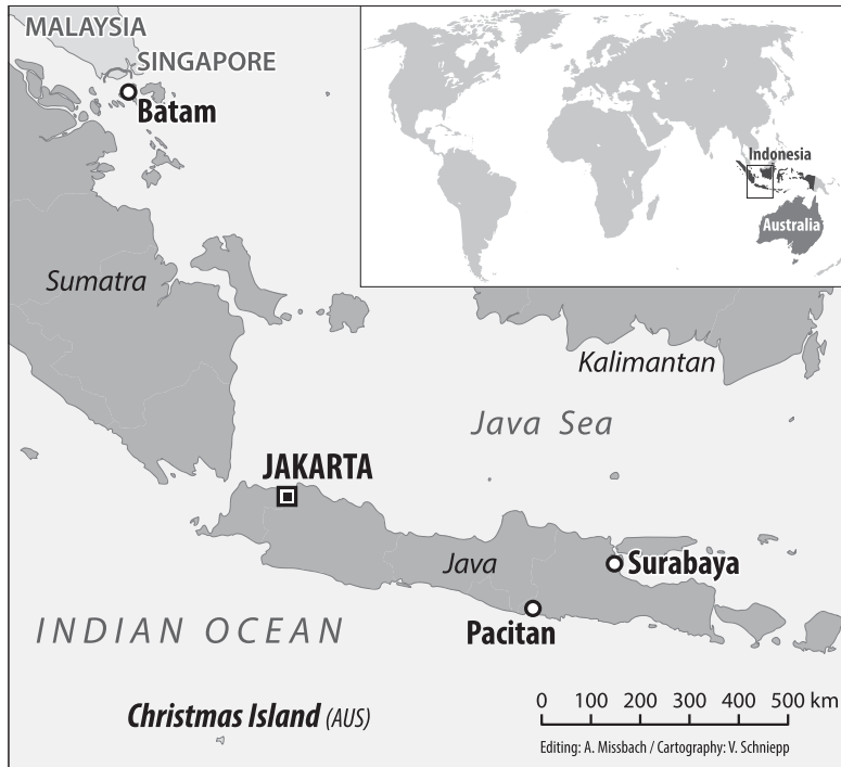
Figure 1. Map with smuggling operation sites

The trial court then convicted the men but, much to the frustration of the Attorney-General's Office, the drivers were sentenced to two years in prison, contrasting with the experience of drivers in other smuggling operations tried in other courts, who had received the much more severe minimum sentence. The Attorney-General's Office appealed on the basis that the judges had not fully applied the law in their verdicts. The reviewing judges increased the sentences, which were still below the minimum sentence. Subsequently, the Supreme Court rejected the Attorney-General Office's second and final appeal, arguing that the new sentences were severe enough already. Judges have also ignored statutory minimum sentences for other crimes, such as corruption and possession of illicit drugs, so these below-minimum sentences for migrant smuggling are a further resource for examining the extent of judicial discretion in the Indonesian judiciary.