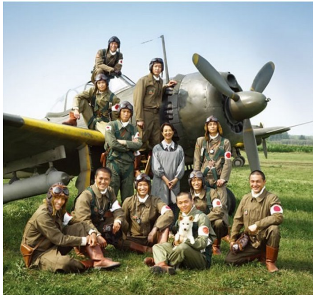
Promotional photo of the cast of "Ore wa, kimi no tame ni koso shini ni iku" (a literal translation of which is I will go to die for you above all), the controversial 2007 movie about a World War II kamikaze pilot written and produced by Ishihara.

famously in the 1989 polemic he wrote with Sony CEO Morita Akio, The Japan That Can Say No , a high-handed claim of Japanese superiority. He continues to offend China with his occasional use of the derogatory term "Shina" from the Japanese imperial era.