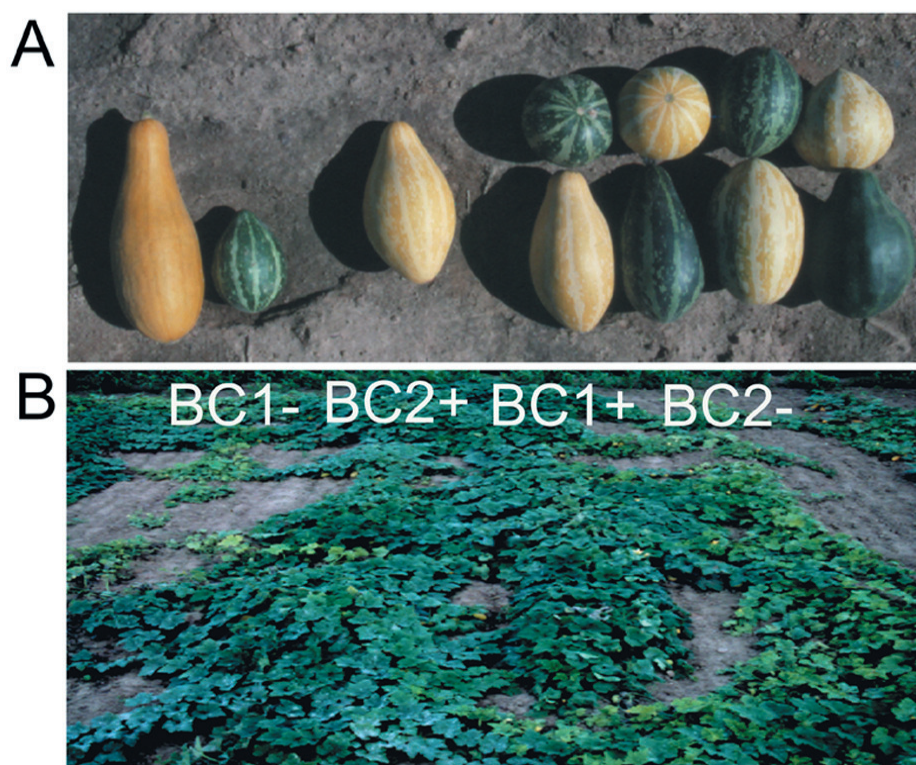
Figure 1. Shoot growth and fruits of C. texana and C. texana × CZW-3 hybrids. (A) Eight distinct fruits of BC1 hybrids (extreme right) are compared with one fruit of CZW-3 (extreme left), C. texana (second to the left), and F1 hybrids (third to the left). (B) Vigor of nontransgenic BC1 (extreme left row) and BC2 (extreme right row), and transgenic BC1 (central right row) and BC2 (central left row) hybrid segregants under conditions of high disease pressure of CMV, ZYMV, and WMV. (This figure is available in color in electronic form at www.edpsciences.org/ebr ).