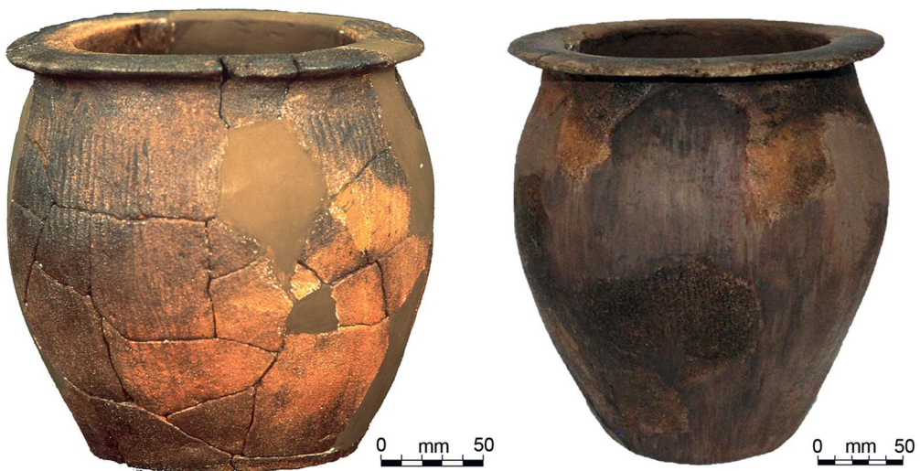
Figure 3. Photographs of the studied AQTA ollae: left) pot type 701a; right) pot type 701.

Our objectives are to identify the sources of the raw materials and to characterise the production technology, as well as to test hypotheses relating to the function of these pots. We have focused our attention on a set of pots bearing incised marks made by the potters. Previously published work has revealed that several of these marked pieces correspond to the