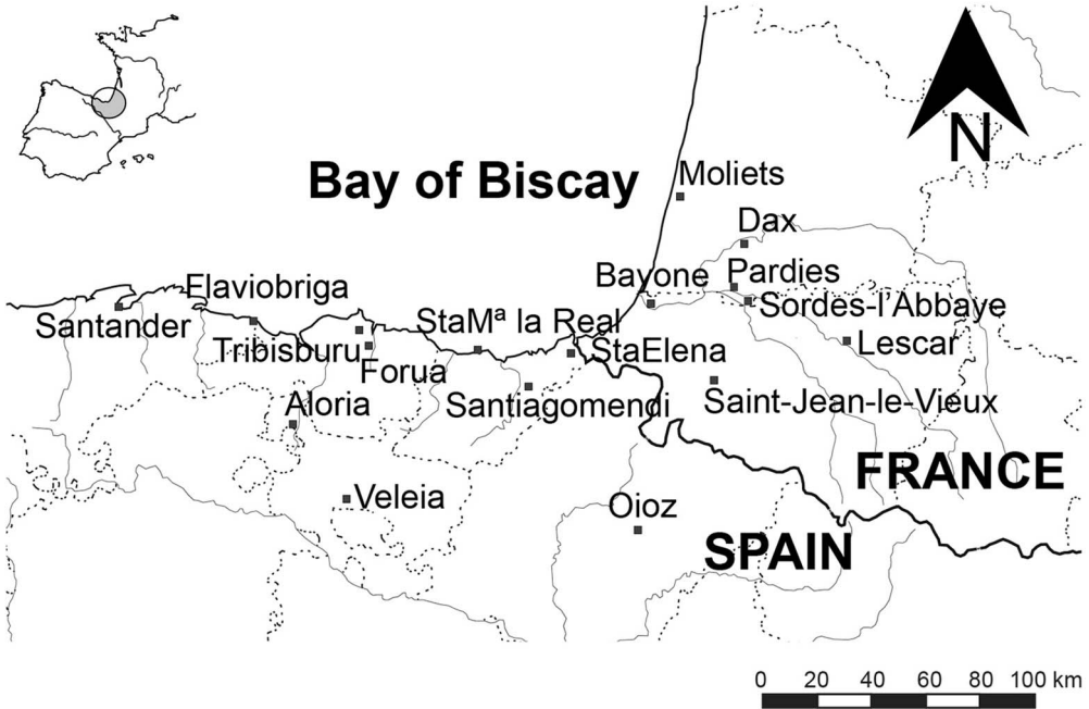
Figure 2. Distribution of the archaeological sites from which ceramics were analysed.