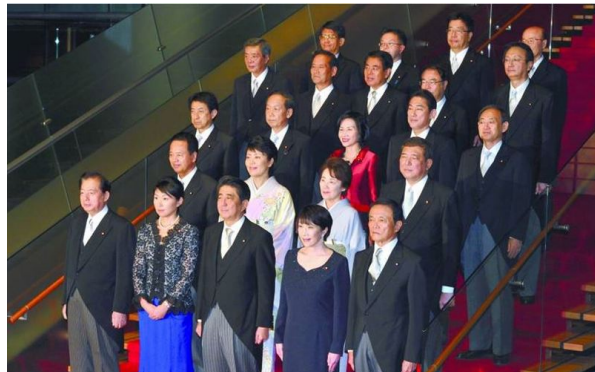
Womenomics in Japan: Five female ministers were appointed in the recent cabinet reshuffle in September 2014, but within a month two were forced to resign.

This strategy of empowering women has been dubbed “womenomics”. Abe himself started to implement “womenomics” by appointing five female ministers in his recent cabinet reshuffle on 3 rd September 2014.