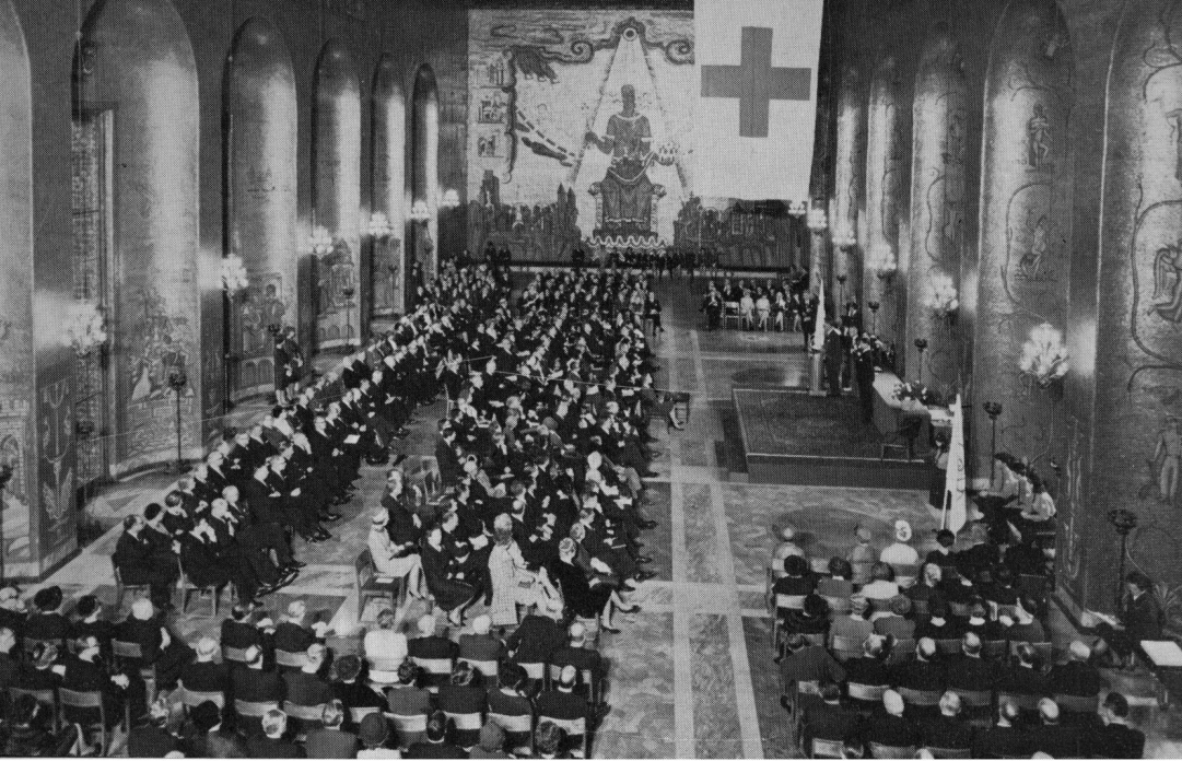
Official ceremony at the Town Hall, Stockholm.