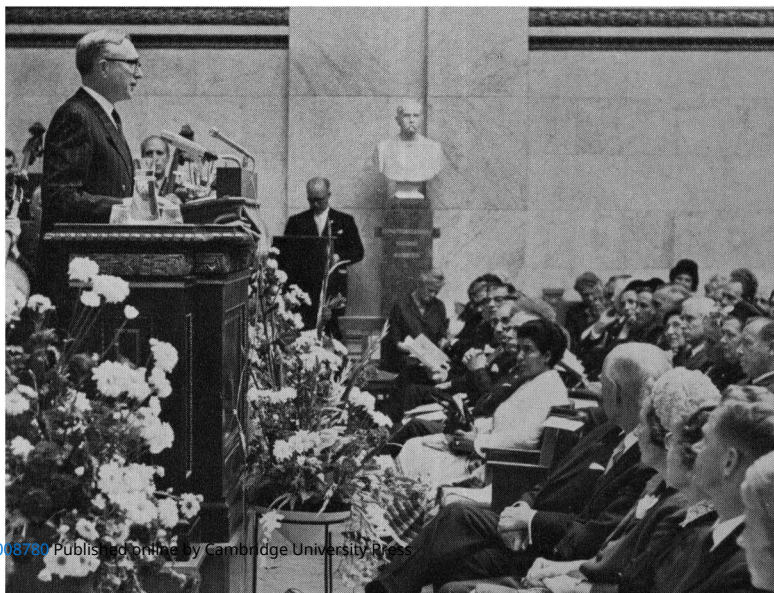
Mr. Edvard Hambro, Vice-President, delivering an address at the official ceremony.