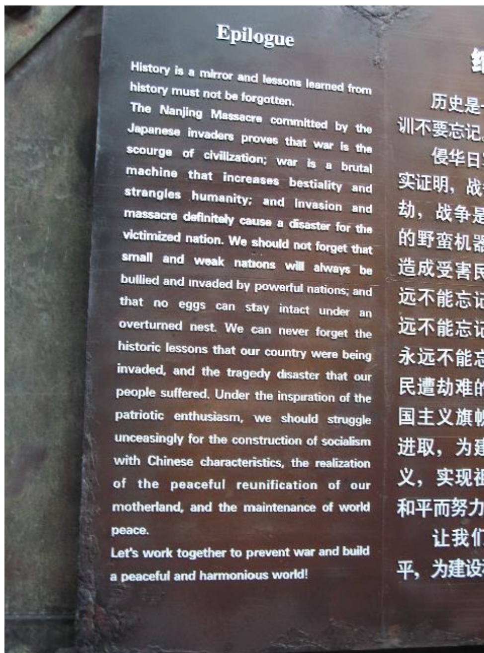
The lessons of history at the NMM.