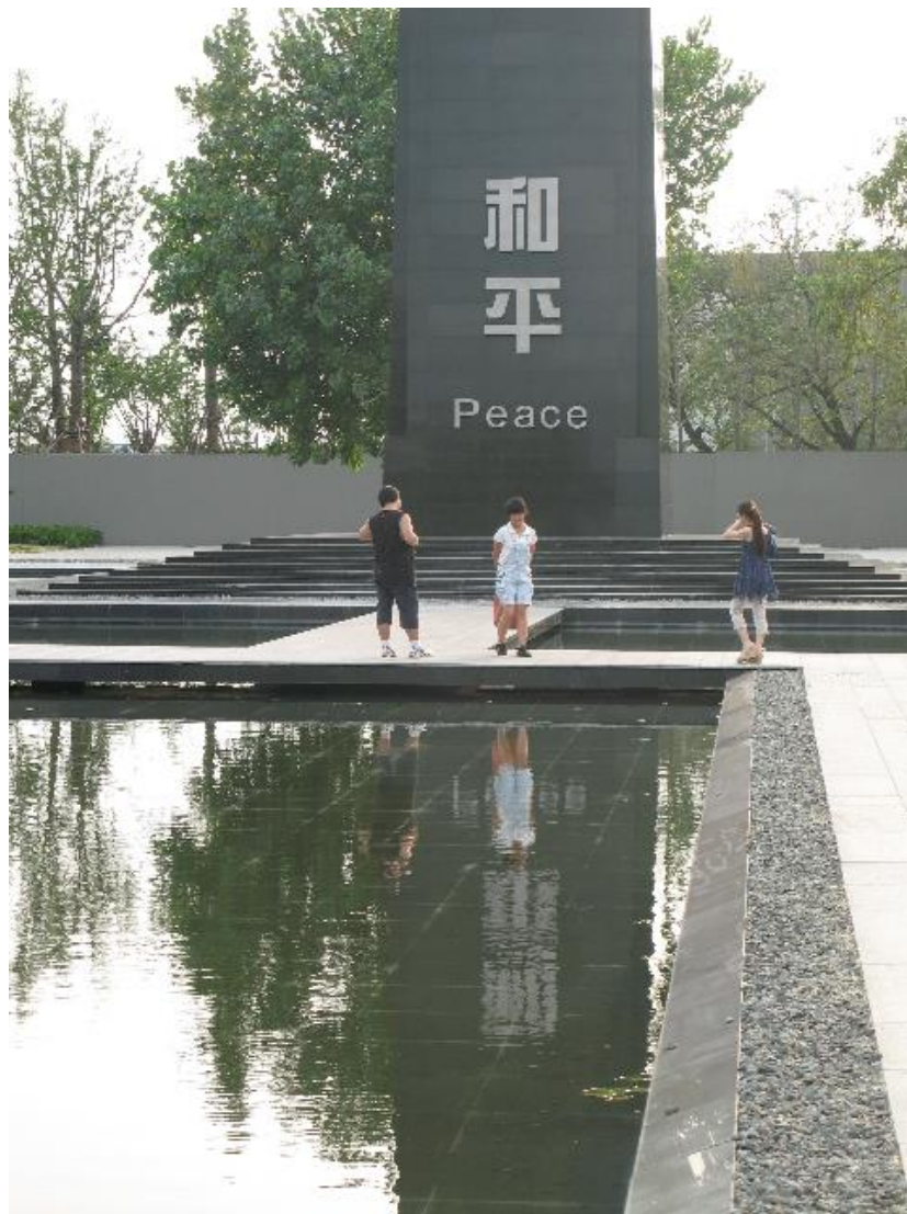
The Peace tower doesn't seem to fit with the NMM's intent or impact