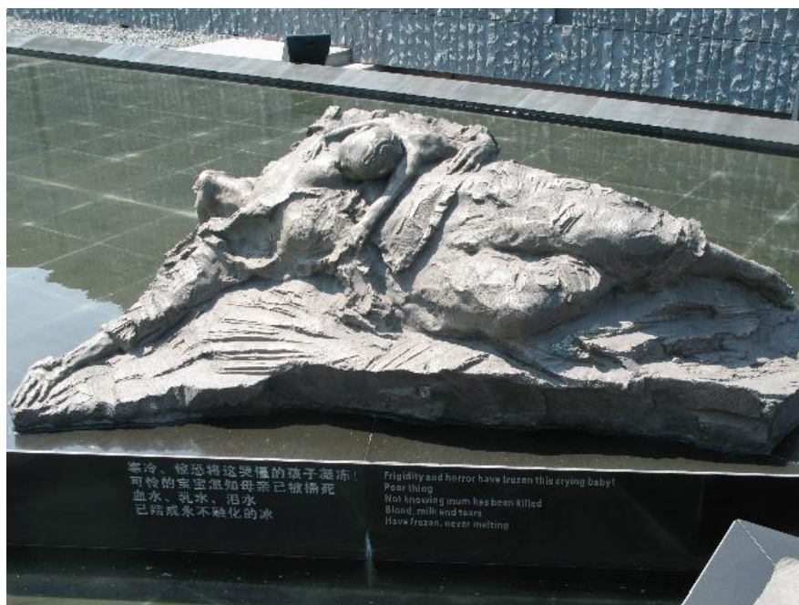
A baby suckling at the breast of a dead mother.