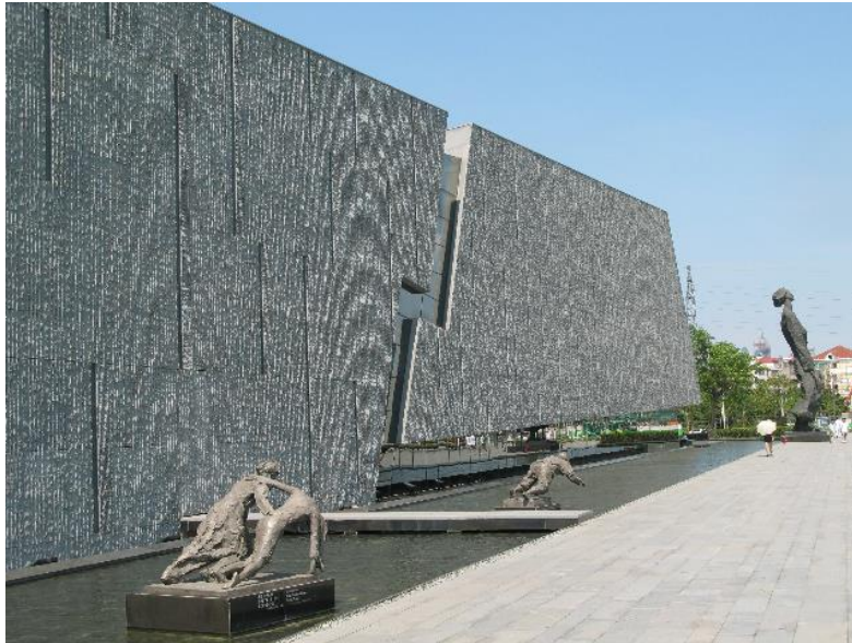
Facade of the new NMM