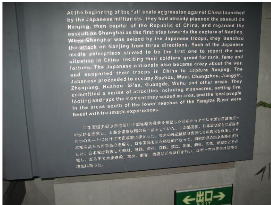
The massacre remembered at the NMM

way from the Shanghai littoral all the way to Nanjing. What happened there then is understood here as a culmination and concentration of the malevolence witnessed all along the invasion route. Perhaps responding to the Yûshûkan's post-9/11 narrative, and with far greater justification, the NMM portrays Japanese troops as terrorists.