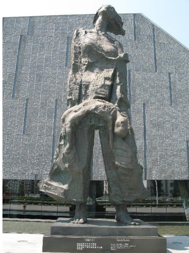
Mother and dead child in bronze nearly as tall as the NMM.