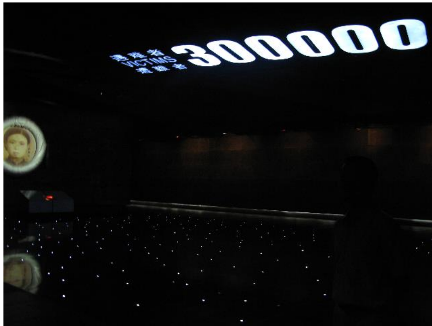
Projected faces of victims float across a pond shimmering with candles beneath a glowing reminder of the death tally.

Visitors descend into the museum, a mood-transforming experience as the past is exhumed and the inferno relived. Down the walkway visitors first confront a replica of the city walls with the sounds of bombardment, air raid sirens wailing, anti-aircraft guns blazing and a video of Japan's attacking bombers. From this sensory assault, one proceeds to a tranquil darkened room with a reflecting pond shimmering with electric "candles" over which projected images of victims' faces float towards the visitor, beneath a ceiling glowing with the talismanic 300,000, as a bell solemnly tolls.