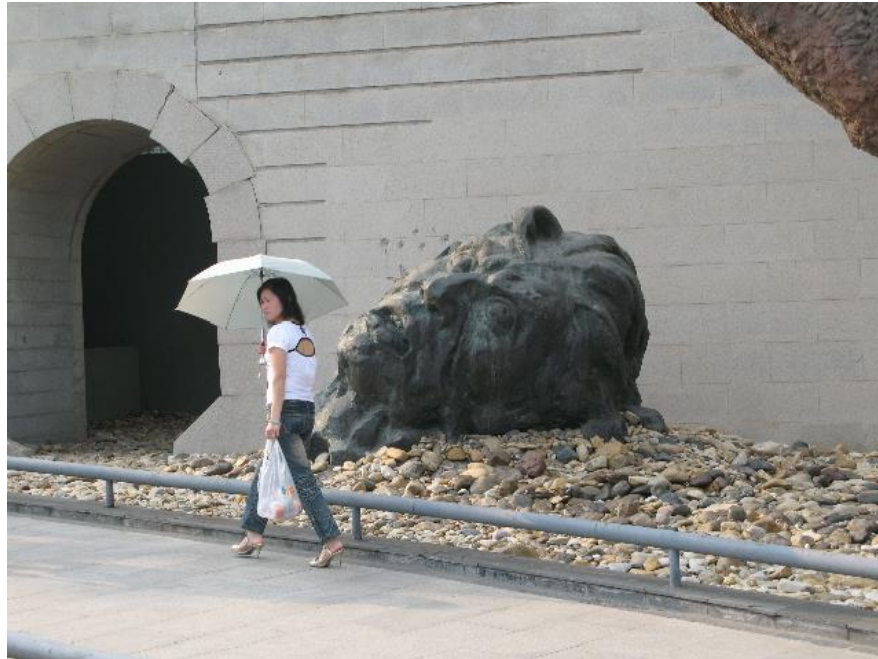
This bronze of a beheaded man lies in the courtyard of the Massacre memorial.