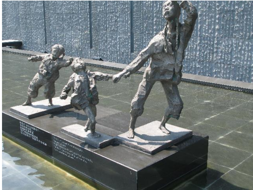
A family fleeing in hope of reaching safety.