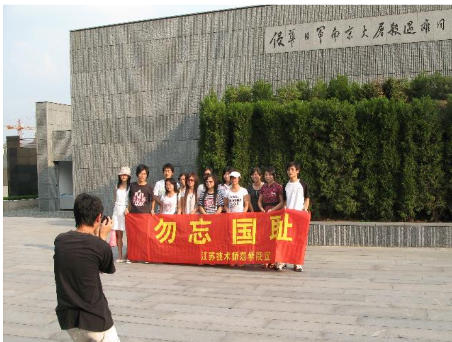
Never forget national humiliation. Group photos are a common sight at the NMM.

Based on my conversations with Chinese visitors, it would be mistaken to assume that everyone embraces this message uncritically in its entirety. The presence of the sign signifies the concern that visitors might ‘miss’ this message. Whether visitors take their cue from the state is hardly certain and overlooks ways in which the narrative of war memory is contested in China within the leadership and between the state and the people. The more than 10 million visitors to the NMM since it opened in 1985 attest to its popularity, but it would be a mistake to assume that all visitors come to learn about and reflect on history; there are groups who pass through the facility as casual tourists seeing the famous sights of Nanjing, stopping to pause for group photo sessions outdoors—photos inside are prohibited—sometimes longer than they spend absorbing the displays. It is also possible that many diaspora Chinese, attracted to the “forgotten holocaust” theme in Iris Chang’s book, The Rape of Nanking (1997), share the outrage she felt when she visited the NMM in ways that may overlap, but also differ from those of Chinese residents in China where the politics of identity resonate differently. A Taiwanese professor I met by chance confided that even though he bears no grudges, the NMM is a welcome recognition of the atrocities committed against ‘his’ people by a regime that had long overlooked this dark chapter in favor of trumpeting its own heroic victories against the Japanese.