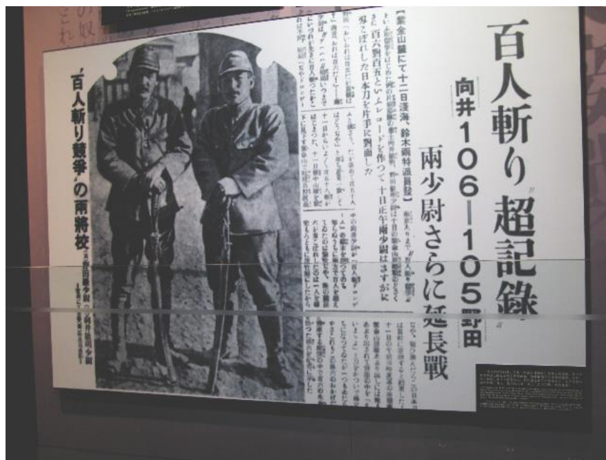
A copy of a Japanese newspaper article about the 100-man killing contest is on display

The final image as one emerges from the NMM is a towering obelisk inscribed with PEACE (in English and Chinese) that flickers in a reflecting pool. It is a jarring juxtaposition to the violence and mayhem featured inside, an unconvincing accessory that fails to persuade. None of the Chinese who accompanied me on this tour felt the message either masked or matched the museum's intentions and impact. One young Chinese man bluntly confided that the museum left him angry, reinforcing his already hostile views towards the Japanese. He said, "Yes we like Japanese technology, gadgets and machines, but not the people. At that time they always referred to us Chinese as pigs, but here we see who was really an animal and inhumane."