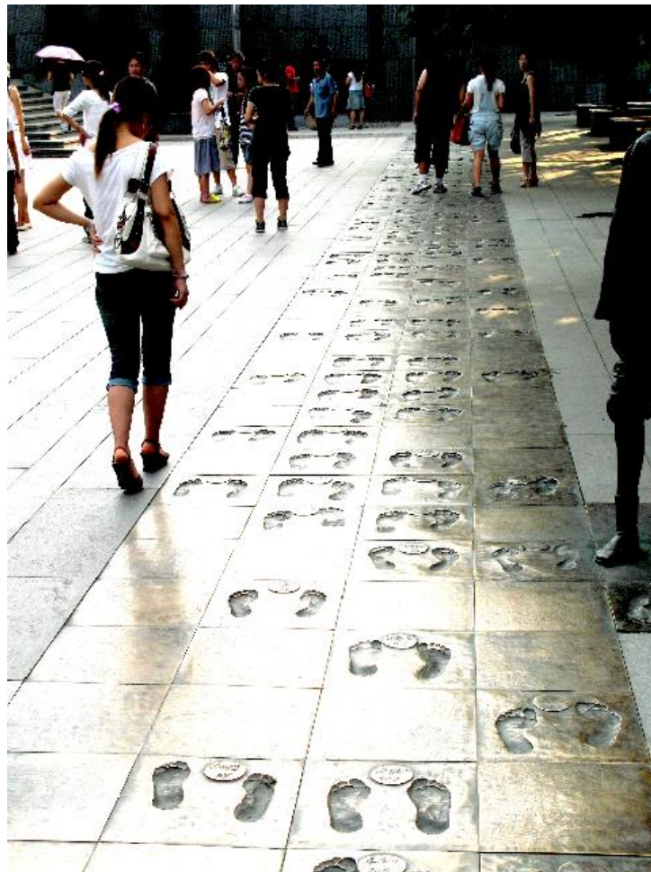
Over 200 footprints of survivors of the massacre are cast in bronze at the NMM.

responsibility. The media tends to sensationalize this discourse and generates misperceptions that fan hostility. As a teacher I have noticed how much better informed Japanese students are now than they used to be twenty years ago about this shared past. Thus only one of the more than one hundred research papers on Nanjing submitted in my classes in recent years expressed anything but condemnation and contrition. The only sign of contemporary Japanese contrition at the Massacre Memorial, however, are mute, decorative garlands of origami cranes, looking rather forlorn, piled as they are on a shelf visitors hurry past on their way to the exit. Though it may be scant consolation to Chinese that few Japanese seek a national identity rooted in an airbrushed history, knowing this might be a useful step towards reconciliation.