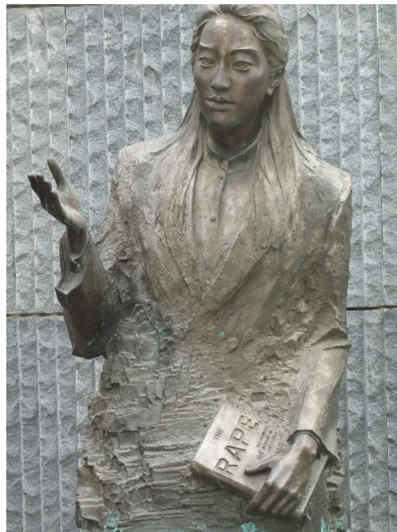
Bronze attesting to a common crime committed by the Japanese troops in Nanjing and elsewhere.