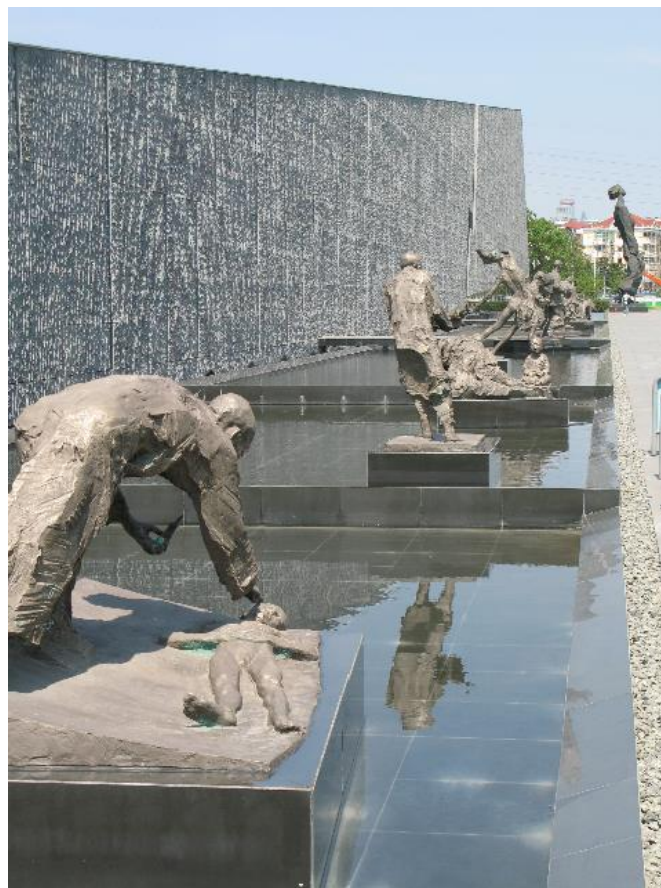
Bronzes in front of NMM depicting victims caught up in the Japanese maelstrom.