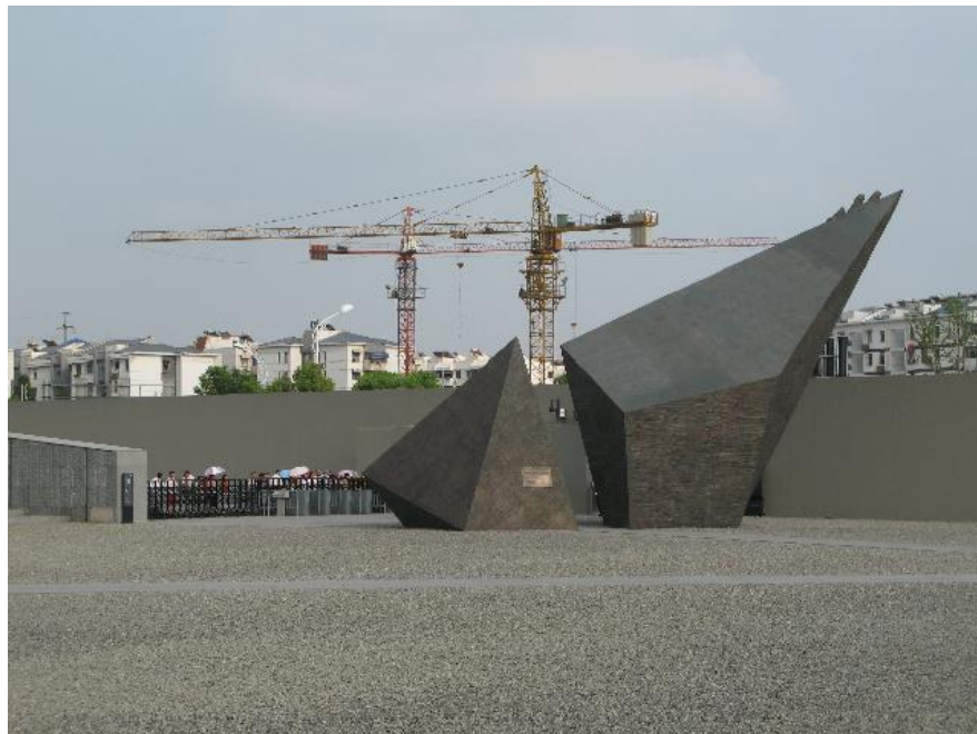
Entrance of the NMM

The narrative of Nanjing in 1937-38 on display at the renovated Yûshûkan Museum on the grounds of Yasukuni Shrine in Tokyo is a lesson in the politics of war memory. [5] There one can view a video of Japanese troops raising their arms while bellowing a collective "banzai" from atop Nanjing's city wall that abruptly cuts to a scene of a soldier ladling out soup for the elderly and young while the narrator explains that the Japanese troops entered the city and restored peace and harmony. Throughout the exhibit, Japan's invasion of China is portrayed as a campaign to quell Chinese terrorism, a post-9/11 narrative that demonstrates just how much the present impinges on the past. At the Yûshûkan , there is no mention of invasion, aggression, massacres or atrocities committed by Japanese troops in China, or, for that matter, of Japan's defeat in the war. Indeed, Japanese suffering is the only suffering on display.