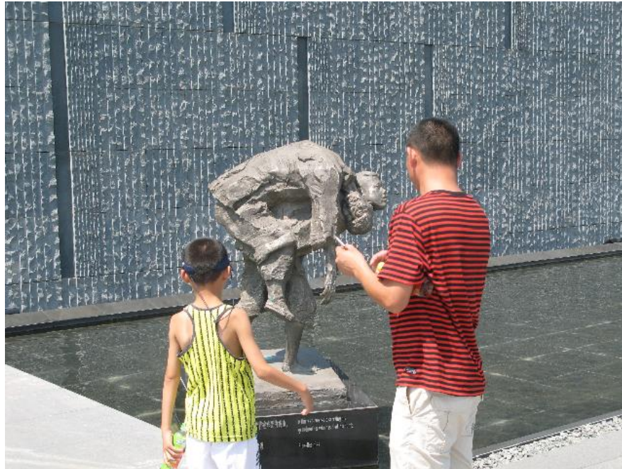
Chinese father and son look at bronze depicting familiar sight in December 1937 of relative carrying dead and maimed relatives away.

One unexpected display shows the Kuomintang (KMT) forces that defended and then abruptly abandoned the capital, leaving its remaining denizens to their fate. This display was not in the original NMM, only appearing from the mid-1990s. Nanjing was the Nationalist capital and the massacre was, therefore, a story in which the CCP has no role. War memory during the Mao era featured examples of heroic resistance by the CCP, so Nanjing was pushed to the margins of war memory discourse. Nanjing based scholars recall that a study on the Nanjing Massacre by local researchers was suppressed in the early 1970s. It is only with the emergence of a parallel victim's narrative in the post-Mao era that Nanjing gained greater prominence in the narrative of war. [6]