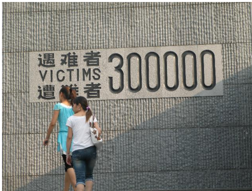
Visitors confront the iconic 300,000—the number of massacre victims claimed by the Chinese government throughout the exhibits.