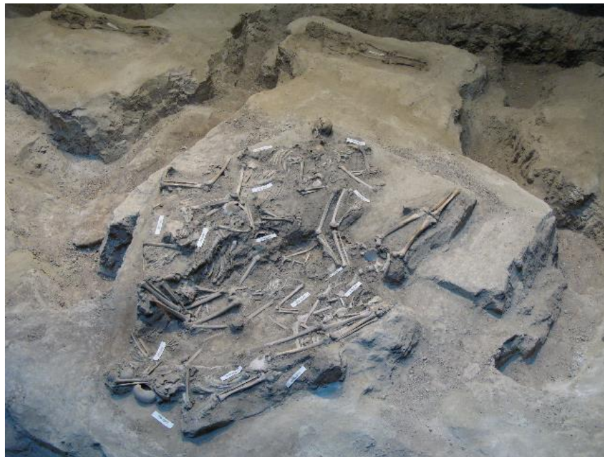
A mass grave site excavated on the site of the NMM.

Among the unremitting gamut of displays, there is also an excavation of a mass burial site with several skeletons piled one upon another, helter-skelter, grisly evidence that was unearthed from beneath the museum. [8] In this gallery of horrors there is a Shooting, Sabering, Burning and Drowning corner that graphically portrays in photographs, confessions, testimony and soldiers' diaries the means of massacre. We also learn that many of the tens of thousands of raped women were murdered as a standard procedure to eliminate witnesses. On display are some of the victims humiliated as they were forced to pose for pornographic photos by their rapists.