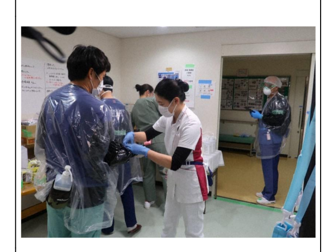
Due to shortages of PPE, staff at the Hokuso Ikusei-en Welfare Facility in Chiba must wear trash bags for protection

circumstances, thus, can be a precarious affair. However, the outbreak of COVID-19 has significantly magnified the risks and dangers involved. Already suffering from a scarcity of human and material resources, many ALFs have been unable to secure supplies of personal protective equipment (PPE) and institute social distancing policies.<sup>36</sup> Paired with the fact that some disabled residents are particularly susceptible to disease, this reality has contributed to abnormally high rates of infection (called 'clusters') in ALFs throughout Japan.<sup>37</sup> At an ALF in Chiba, for instance, 51 of 70 residents (73%) and 40 of 67 employees (60%) have been infected, while the rate of infection among the general public in nearby Tokyo is only 7.5%.38