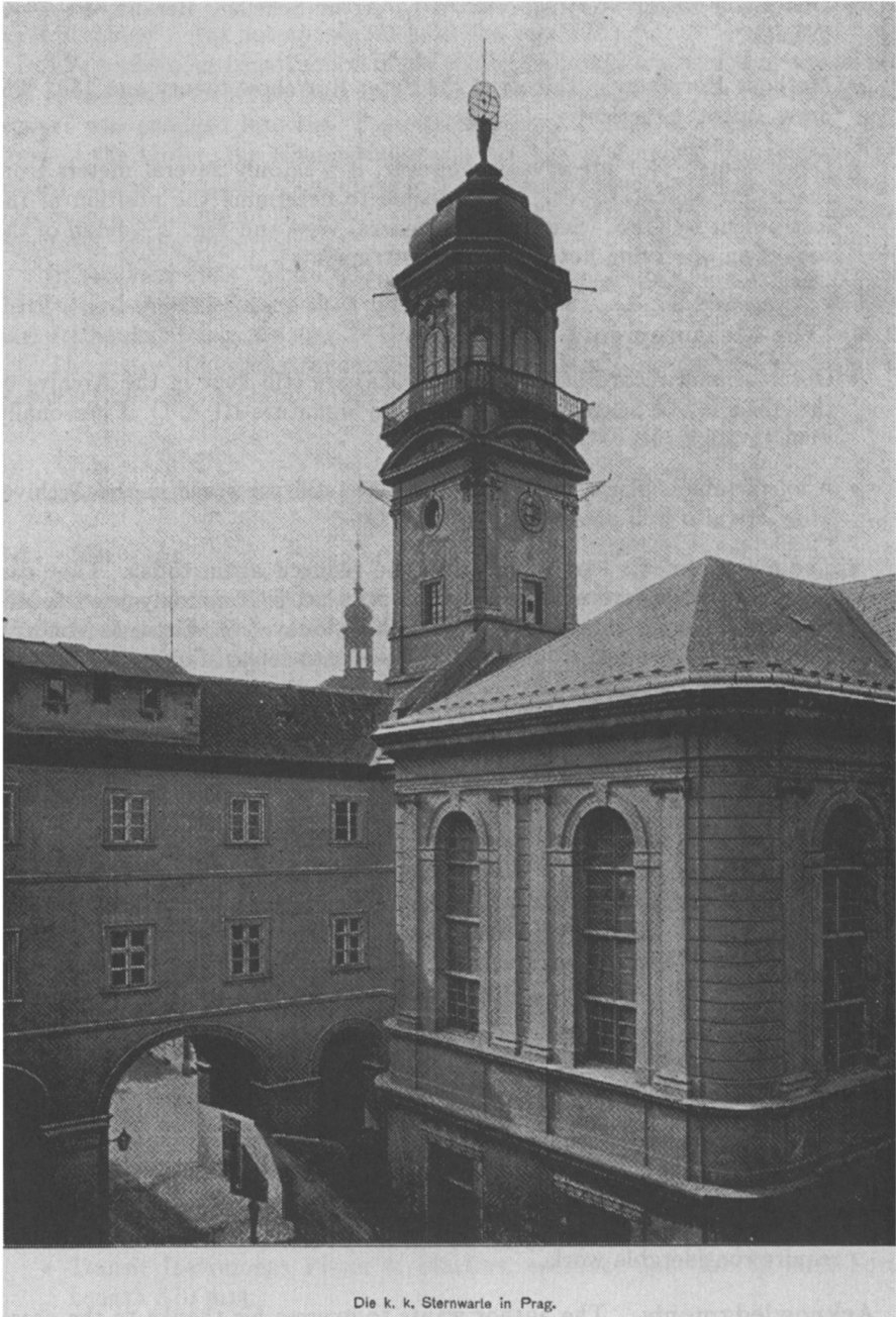
Die k. k. Sternwarte in Prag.