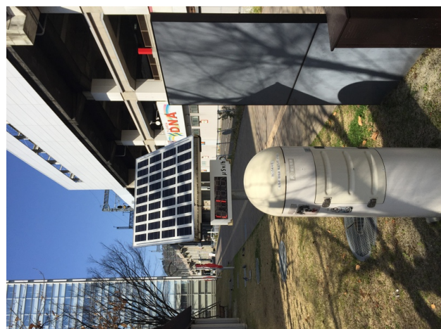
Fig. 2: Fixed station radiation monitor post.

All of us have been dealing with the horrors and the terrors of the COVID-19 pandemic since early 2020. Viscerally, we feel the anxieties and fears that accompany uncertainty about dire risks to our lives and loved ones. Being cautious about our public activities in the age of COVID makes intuitive sense. We navigate our potential exposures, work to mitigate our potential contaminations, and worry endlessly about loved ones with health concerns. Each small, unrelated medical symptom a family member exhibits is met with anxiety. This is a reality for people worldwide. Those who live in areas dense with radionuclides face similar anxieties: the locations of the risk are indeterminable; who is being exposed and who is safe is unclear, even while the damage is inflicted; daily life is rife with anxiety. But in radiologically contaminated communities it is not conspiracy theorists on social media dismissing them as irrational, it is state health officials. They draw maps, based entirely on externally measured levels of radiation, and use those maps to tell people to move back to villages where the levels of contamination are “acceptable,” to send their children to schools and move back to towns where the presence of radioactive particles is not dense enough to register on Geiger counters placed high above the ground.