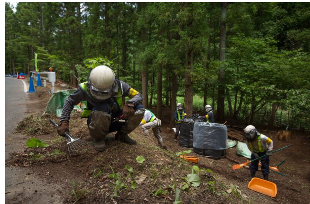
Fig. 3: Decontamination crew works to decontaminate a roadside in Iitate in 2015.

Almost certainly the particles in the forest canopy and on the trees will re-contaminate this roadside within a year.