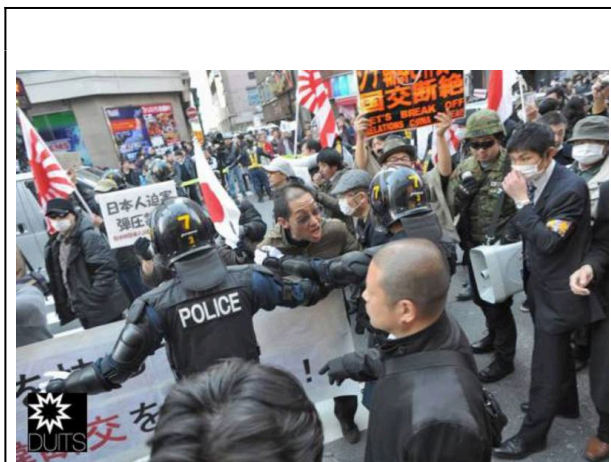
Police stand between Zaitokukai and anti-racist marchers in Tokyo, 2013

The one-hour protest of hundreds of people under banners with slogans like ‘Kill the good Koreans, kill the bad Koreans, kill them all!’ was an intolerable act of hate speech that should not be defended in the name of ‘free speech’. By the same token, can we say that the display of a number of extremely large panels depicting a naked girl with four severed limbs wearing a dog collar smiling faintly in an exhibition held over many months and viewed by tens of thousands of people that was organised and promoted with a financial budget likely to have been very large, and held on the top floor of a building in the most expensive location of Roppongi Hills, is merely a form of expression? A form of expression that must be protected in the name of free speech?