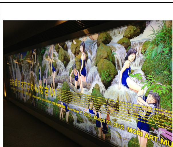
Railway station advertisement for the Aida Makoto