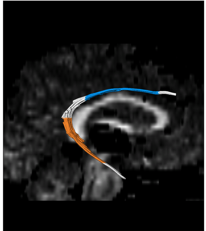
Figure 2: Cingulum Tractography. The following landmark parameters were used: 1. Body: the portion of the cingulum coursing posteriorly from the most posterior point of the rostrum to the most anterior point of the splenium (blue). 2. Posterior: the portion of the cingulum coursing inferiorly and laterally from the most superior point of the fornix to the level of the midbrain (orange). FA and MD values were calculated for fibers contained within the specified regions bilaterally.

The baseline characteristics of the subjects are reported in Table 1. There was no difference between the PD, PDD, and control groups in age, education, or whole brain grey or white matter using a one-way analysis of variance. Post hoc tests revealed significantly lower MMSE scores in the PDD group than in the control or PD groups ( p < 0.05 ). Parkinson's disease and PDD groups had significantly higher UPDRS scores than controls, as expected ( p < 0.05 ).