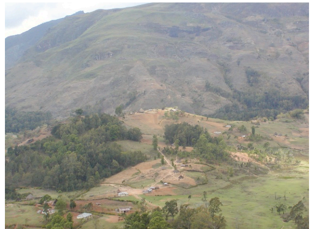
Landscape of drought-stricken Maubisse, East Timor

Anxiety also fed on the ominous omen of the birth of a one-eyed pig with an elephant-like snout. Then, when a lake outside Dili suddenly turned blood red, many saw it as a harbinger of violence in 2007.