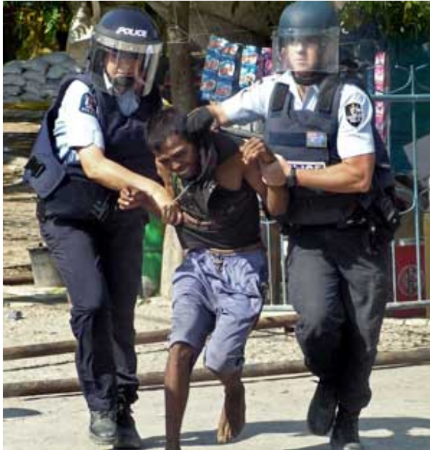
A youth is detained by Australian police in East Timor, 2006.

This officer says the gang violence has reached a new stage that it shows signs of coordination. Whereas previously gang attacks seemed random, they are now being choreographed. He noted an evening when three melees broke out simultaneously in different areas in Dili in a move that seemed designed to test the responses and capabilities of the over-stretched security forces.