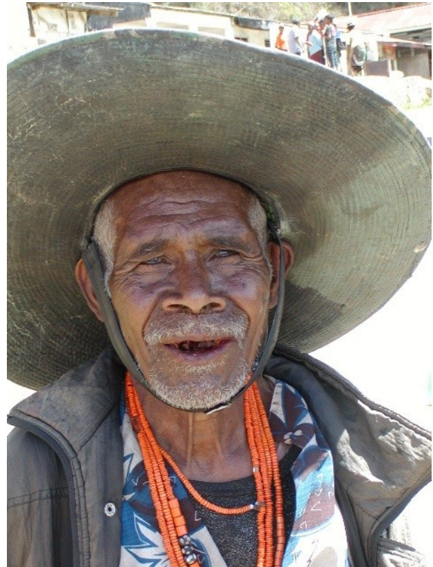
An East Timor elder, teeth darkened by betel