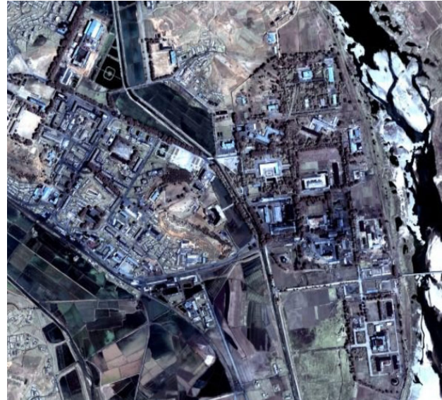
Yongbyon Nuclear Facility

Bolton slips in a sly suggestion that North Korea is cloning Yongbyon elsewhere. In briefings with its Asian allies in early 2005, the United States similarly accused North Korea of providing Libya with uranium hexafluoride. It turned out that the U.S. government had misled its allies, however. North Korea had provided the material to Pakistan, which already has a nuclear program, a business transaction that the United States had known about for years.