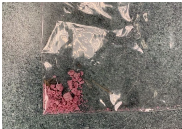
Figure 1 The pink powder that was discovered underneath a desk in the patient's 3rd grade classroom.