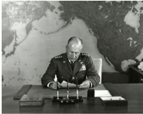
General Thomas Power presided over the creation of SIOP-62 as Commander in Chief, Strategic Air Command (1957-1964) and Director, Joint Strategic Target Planning Staff (1960-1964).

As nuclear intimidation continued, and as other nations sought to gain 'parity', the global nuclear industry grew. It was clearly understood in these early decades that the dual-use of nuclear materials in nuclear energy generation and nuclear weapons served to establish and maintain national influence in the international arena. Since 1945, the supply and procurement of uranium together with coal (for steel production) has been a good indicator of a nation's capacity to both rapidly increase its energy production with the potential to produce munitions and, for those states already with the capacity, to produce and enhance a nuclear weapons arsenal. High-energy power generation was an index of a nation's war-making potential underlining the link between mining and militarisation.