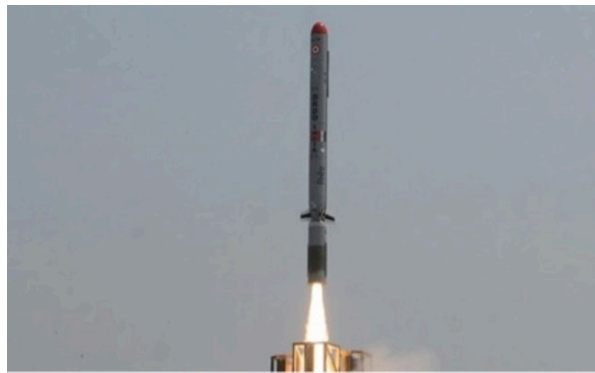
'Nirbhay' sub-sonic cruise missile launched from Chandipur, Odisha, India on 17 October 2014

also be used to fuel nuclear submarines, space satellites, tactical and intermediate ballistic missiles, and multiple warhead Intercontinental Ballistic Missiles (Agni V ICBM MIRVs) with the ability to reach cities in China and Pakistan. India joins the US, Russia, UK, France and China in possessing the ICBM with MIRV, leaving Pakistan further behind in terms of weapons parity, particularly in navy, air and ground forces, and missile capabilities. 64 As India seeks to rival China, it could further destabilize relations with Pakistan by intensifying the ongoing arms race between the two. Regional tensions could be further exacerbated by Pakistan's border skirmishes with Afghanistan and Iran over its support of the Taliban in Afghanistan. 65 Along with increasing tensions involving US-Japan-India and China, this is precisely the scenario that NPT members have tried to avoid by subscribing to IAEA safeguards.