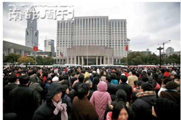
Shanghai residents' "collective walk" at People's Square in protest against the Maglev Train project, January 2008.