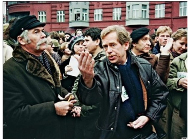
Vaclav Havel (right) and other Charter 77 signatories address demonstrators in Prague on December 10, 1988, to celebrate the 40th anniversary of the Universal Declarations of the Human Rights.

Constitution of the United States, the French Declaration of the Rights of Man and Citizen, the Universal Declaration Human Rights of the United Nations, and the reconciliatory approach of South Africa's Truth and Reconciliation Commission, as well as relevant Chinese documents throughout the modern era, including the Constitution of the People's Republic of China.