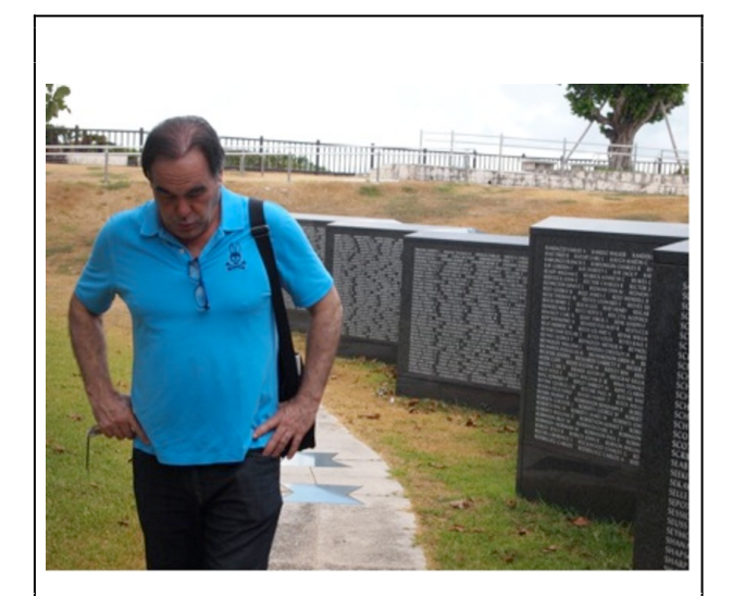
Stone at the Peace Memorial Park in southern Okinawa.

In the adjoining Peace Memorial Museum, he stopped to read each description of the Japanese forces' pre-war militarization of Okinawa - and he heard how, in the 1990s, the authorities had attempted to interfere with the museum's displays so as to play down Imperial Army aggression. Then he squeezed himself among a row of schoolchildren to watch a short documentary about the battle.