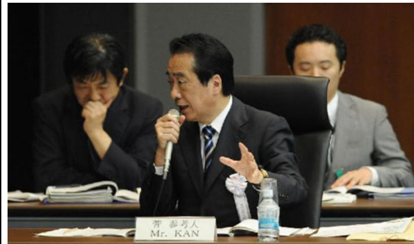
Prime Minister Kan Naoto Testifies to Diet Commission

independently from the government. Seeking to bolster the commission's credibility, Kan outlined three principles as the basis of the inquiry: independence from the existing nuclear energy administration, openness in disclosing findings domestically and abroad, and comprehensiveness in covering both technical and administrative questions related to the accident. 9