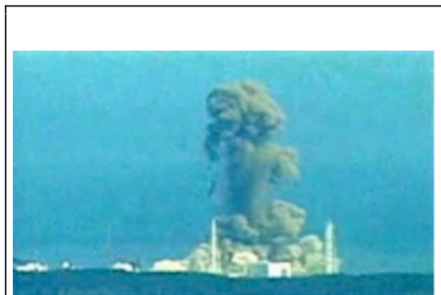
Explosion at Fukushima Daiichi Nuclear Power Plant March 2011

Despite the severe consequences from the Fukushima nuclear disaster, Japan's current government appears determined to return to the pre-disaster policy of promoting nuclear power as a key source of energy, promising improvements in safety standards. 2 The governing Liberal Democratic Party (LDP) will likely take controversial decisions on reactor restarts following the July 2013 Upper House election. Given this outlook, it seems crucial for Japan and others to reflect on and incorporate the lessons that can be drawn from the Fukushima disaster, so as to prevent or better contain possible future crises.