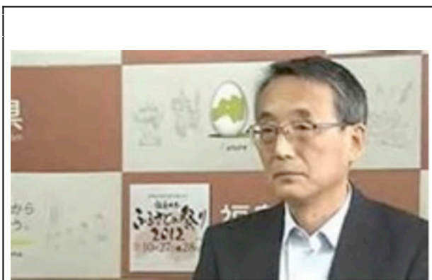
Tanaka Shun'ichi is Chair of the Nuclear Regulation Authority

new safety standards draft was greeted by significant protest from the utilities, which fear that total costs of implementing these standards may amount to as much as 1 trillion Yen. 187 These protests seem to be a good initial sign of stricter administrative oversight. The NRA is also re-examining safety assessments on fault lines below existing nuclear plants and has concluded that some reactors are sited on active faults. Nevertheless, one of the greatest challenges for the NRA will be to foster employees with specialized knowledge and expertise who do not have close ties to the nuclear village and will thus ensure institutional independence. Most of the current NRA employees were simply transferred from the previous regulators, NISA and NSC, and many lacked sufficient expertise. 188 Moreover, the five commission members of the NRA have been criticized for their close relations to the nuclear village. 189 In line with the Diet-led commission's suggestion, the Lower House set up a panel in April 2013 to monitor nuclear power administration. However, this panel has been criticized for its pro-nuclear makeup. A former member of the Diet-led commission suspected the LDP might use it to apply pressure on the NRA to loosen regulations, rather than ensuring strict oversight. 190