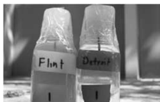
Flint Water Crisis.