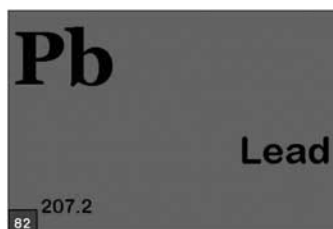
Symbol for lead. Periodic Table of Elements.